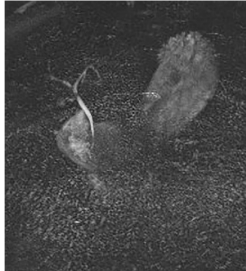
Fig. 5 – Magnetic resonance cholangiopancreatography showing normal liver anatomy, absence of the gallbladder, no common bile duct dilation, and a 6-mm T1 hypointense tubular structure at the liver hilum, consistent with dilated cystic duct remnant.