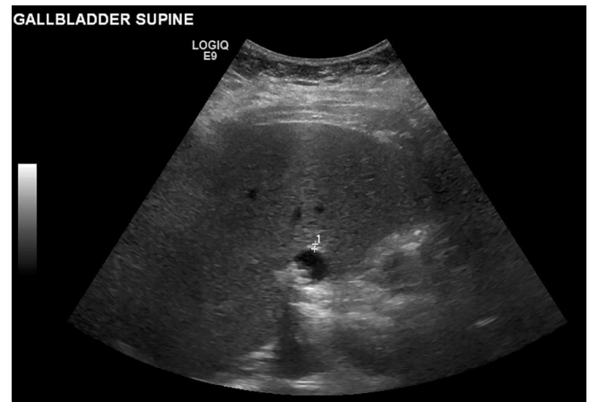
Fig. 1 – Right upper quadrant ultrasound read as a 2-mm gallbladder wall and echogenic gallstones without pericholecystic fluid, Murphy's sign, or common bile duct (CBD) dilation (3-mm CBD).

Two weeks later, she was seen in general surgery clinic where she was prescribed a proton pump inhibitor for presumed