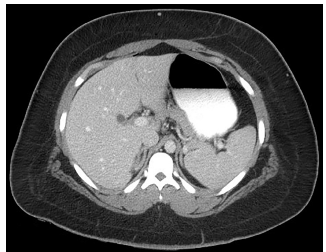
Fig. 2 – Axial view of computed tomography scan of abdomen and pelvis with contrast showing a small 9-mm structure in the gallbladder fossa likely related to gallbladder agenesis with no biliary obstruction and normal hepatic anatomy.

The patient was reported to have continued abdominal pain for the next 2-3 months associated with occasional nonbloody