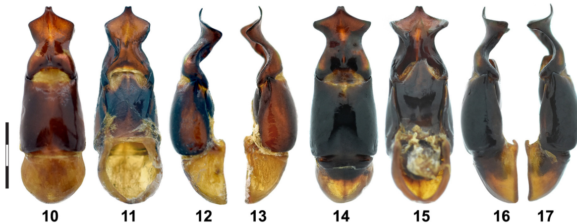
Figures 10–17. Chrysina porioni and C. ericsmithi male genital capsules, scale in mm. 10) C. porioni dorsal view. 11) C. porioni ventral view. 12) C. porioni right lateral view. 13) C. porioni left lateral view. 14) C. ericsmithi dorsal view. 15) C. ericsmithi ventral view. 16) C. ericsmithi right lateral view. 17) C. ericsmithi left lateral view.