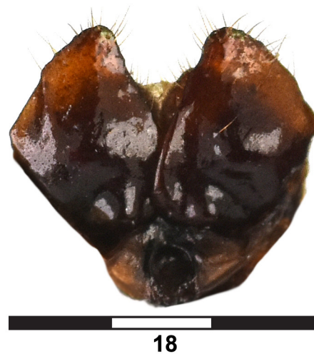
Figure 18. Chrysina porioni female inferior genital plates, scale in mm.

metallic golden color morph (Fig. 3–4). One of the fifteen golden males has a very bright red venter and anterior half of the clypeus, and the legs have a paler reddish tint.