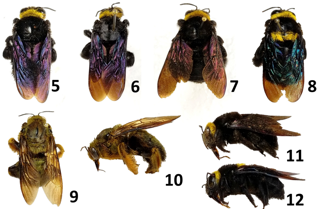
Figures 5–12. Female and male specimens of Xylocopa coronata ; all are X. coronata coronata except for the female of X. coronata combinata in Figures 8 and 12. 5) Dorsal habitus, female, Halmahera. 6) Dorsal habitus, female, Bacan. 7) Dorsal habitus, female, Tidore. 8) Dorsal habitus, female, Obi. 9) Dorsal habitus, male, Bacan. 10) Lateral view, male, Bacan. 11) Lateral view, female, Tidore. 12) Lateral view, female, Obi.

and P. M. Taylor (11 females); same data except 15–31 January 1981 (2 females); same data except 1–14 February 1981 (3 females and 1 male); same data except December 1980 (1 female), same data except 1–14 May 1981 (2 females); same data except 15–31 July 1981, P. M. Taylor (1 female); same data except no date of collection (1 female); Kao District, Kao River Basin, Air Kanan, Kampung Tuguls, 1–14 March 1981, A. C. Messer and P. M. Taylor (1 female); Kao District, Kampung Kao, 19 March 1981, A. C. Messer and P. M. Taylor (1 female); Tobelo District, Kampung Rupo, 11 April 1981, A. C. Messer and P. M. Taylor (1 female). Ternate Island, T. Barbour (1 female). Tidore Island, Kampung Guaepaji, 5–10 July 1981, A. C. Messer (3 females); same data except 6–7 July 1981 (8 females). X. coronata combinata : Indonesia: Obi, NW Obi, Laiwui, 0–200 m, IX–X.1953, A. M. R. Wegner (2 females); same data except IX.1953 (1 female). All specimens in USNM collection.