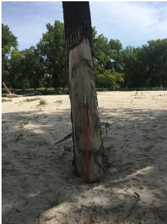
Figure 1. Ice damage on the southwest side of a cottonwood.

The flow of the water was moving northeast, and therefore the damage on the trees was seen on the south and west sides of the trunks. Figure 1 shows the kind of damage that was created due to ice rubbing against the bark and sand being displaced from the river.