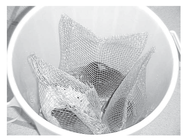
Fig. 1: experimental chambers, each of which enclosed three screen cages that fit tightly within the bucket. The edges of the lids were sealed with Tac-trap to prevent the escape of ectoparasites, and small holes were cut in the lids to provide some circulation of air within the bucket.

23'W), at a research facility, Centro de Estudos Ambientais e Desenvolvimento Sustentável (Ceads) of the Universidade do Estado do Rio de Janeiro A transect of 100-130 livetraps, and 5 or 6 mist nets set along an Atlantic Forest stream provided, respectively, a daily supply of rodents and bats. We constructed closed experimental chambers, where ectoparasitic arthropods were introduced and offered a choice of three different vertebrate hosts, which were placed in close proximity within the chambers, and connected by a common nest substrate (rodents) or roosting surface (bats). The chambers were plastic garbage buckets of 30 l capacity, each of which enclosed three screen cages (3/4" mesh) that fit tightly within the bucket (Fig. 1). The edges of the lids were sealed with Tac-trap© to prevent the escape of ectoparasites, and small holes were cut in the lids to provide some circulation of air within the bucket.