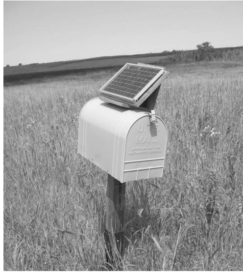
Figure 2. Henslow's sparrow playback stations established on the Spring Run Complex in 2008 and 2009. Playback stations consisted of a portable compact disc player connected to a programmable timer. Timers were connected to rechargeable 12 volt batteries and solar panels. Playback stations were mounted in aluminum boxes for protection from the elements. The aluminum boxes were drilled out in front of the player speakers to allow for sound transmission. Boxes were mounted to 4 × 4 posts at the typical perching/singing height for Henslow's sparrows in each field.