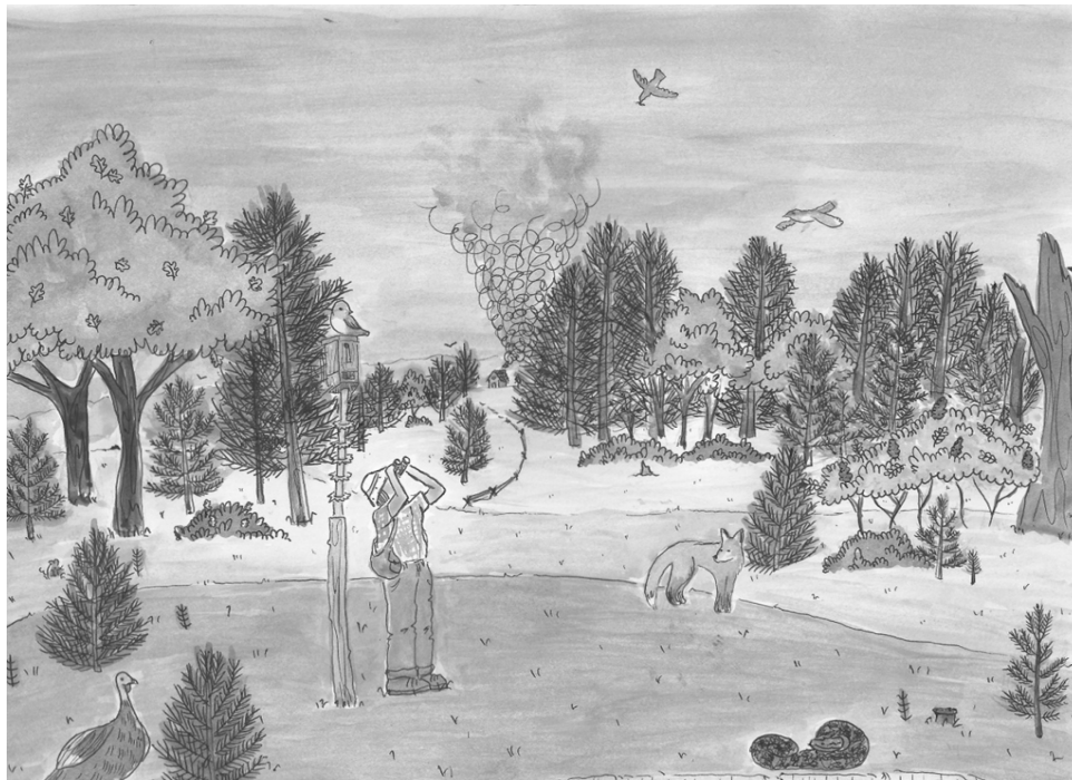
Figure 4. Mural of Rice Lake Plains Tallgrass Communities 1940–1990 by Cheyenne Blacker.

This mural (Fig. 5) depicts the current day RLP. Education and awareness about tallgrass prairie and the species associated with them are enhanced. Stewardship activities including prescribed burns, non-native species removal and planting are widespread. The oak savanna, tallgrass prairie, oak woodland, and sand barren communities on the RLP are now globally and provincially significant. The RLP contains extensive tracts of natural cover with good populations of