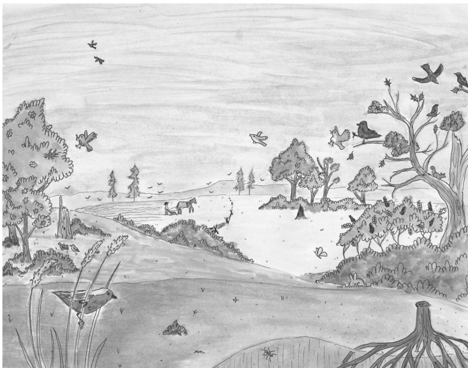
Figure 3. Mural of Rice Lake Plains Tallgrass Communities 1870–1940 by Cheyenne Blacker.