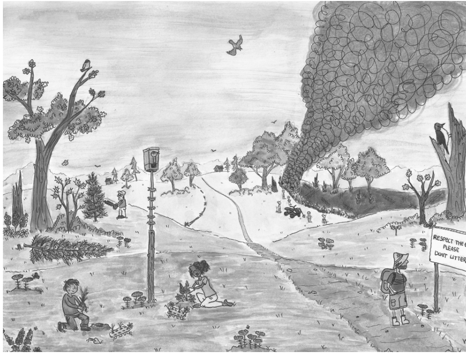
Figure 5. Mural of Rice Lake Plains Tallgrass Communities 1990–Present by Cheyenne Blacker.

tallgrass communities, making it an important area for protection, restoration and long term stewardship.