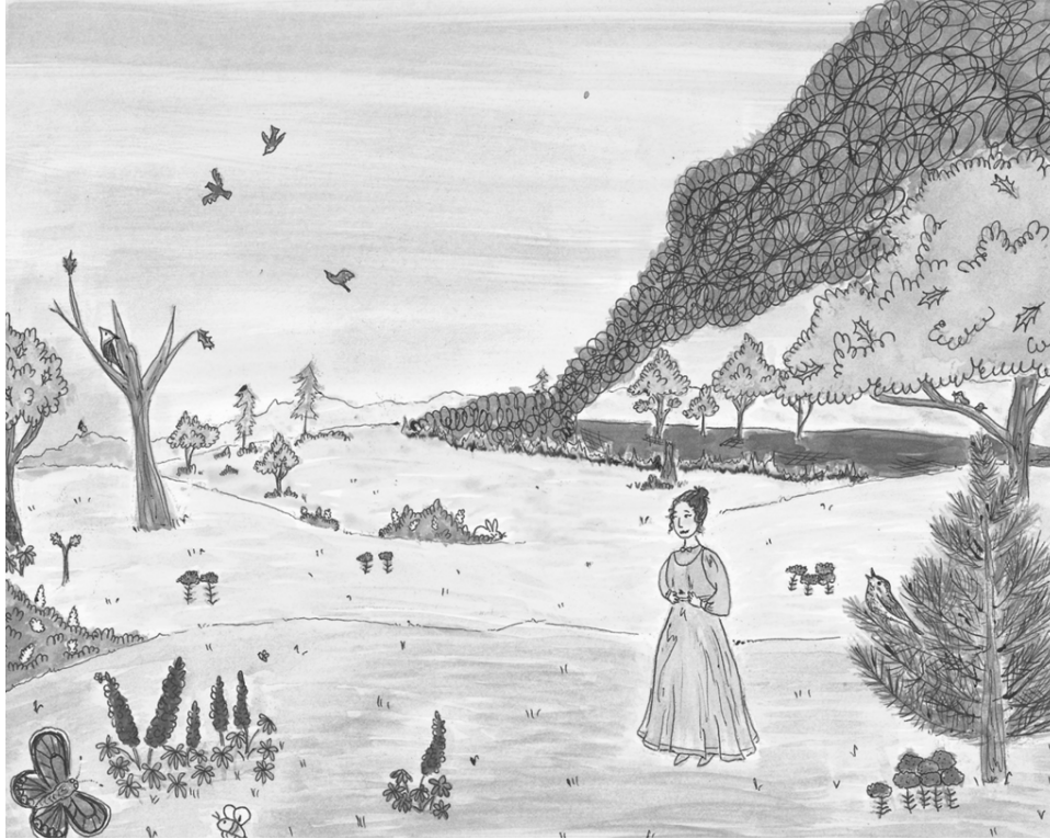
Figure 2. Mural of Rice Lake Plains Tallgrass Communities Pre-1870 by Cheyenne Blacker.