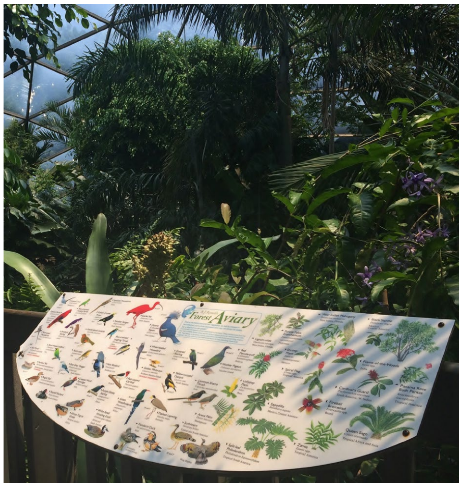
Figure 2 A Placard With Information on Birds and Plants in the Zoo's Aviary

Note. The placards mirrored the paper version of the aviary guide in Figure 1. The color figure can be viewed in the online version of this article at http://ila.onlinelibrary.wiley.com .