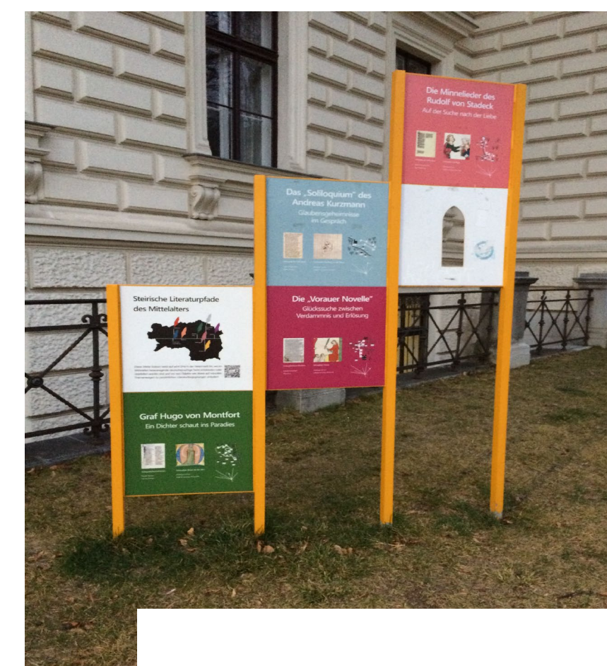
Steirische Literaturpfade des Mittelalters