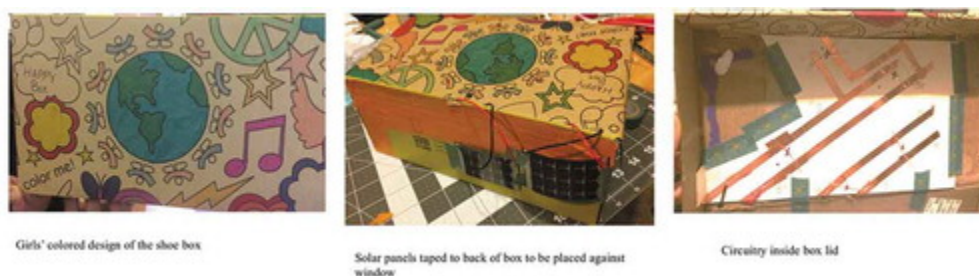
Figure 3. Happy Box.

After receiving input from community dialogue during feedback sessions, the girls determined that the lights really needed to stay lit all of the time “to remind people everyone matters in our class all the time,” rather than only lighting up when a student was turning the hand crank. Moreover, the hand crank only lit three of the five lights they needed. Through further dialogue, the group concluded that Ms. D was more liable to keep the Happy Box in use when it could be done with minimal disruption, and having a student leave his or her seat to crank the generator was disruptive. These considerations, both social and technical, led the girls to change their power source to solar. However, this change presented further technical problems around how to keep the lights lit given the total energy load required and the capacity of the solar panels available. The group then had to build two separate parallel circuits instead of one. The final design split the lights into two parallel circuits to meet the power demands of five lights with two solar panels (see Figure 3).