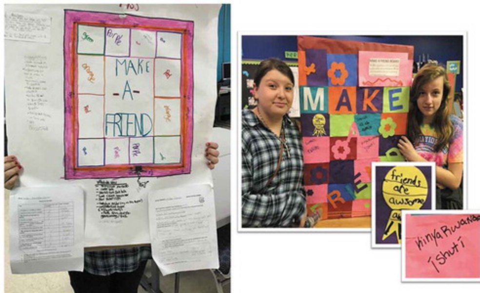
Figure 2. Make-a-Friend Board.

We view the surveys with community members as tools that hold possibilities for opening up new discourse threads for making visible and elevating students' lives within the STEM classroom and as a part of STEM discourse. Although all groups were required to draw on community ethnographic data, they did so to varying degrees of criticality and with different concerns and experiences in mind. Both The Occupied and the No Favoritism group addressed the problem of bullying. Whereas The Occupied sought to actively disrupt the act of bullying, the No Favoritism group sought to produce an educational poster aimed at teachers to help them think more about how they interact with students. These moves made students' lives visible in different ways. In both cases, however, the surveys served as launching points for further dialogue with community members on how and why particular issues mattered to them. This is important because the scientific analysis of community experiences positioned these experiences as powerful inputs to engineering design. Furthermore, because these representations launched dialogue, they supported the increasing presence of students and their lives in legitimized scientific classroom talk.