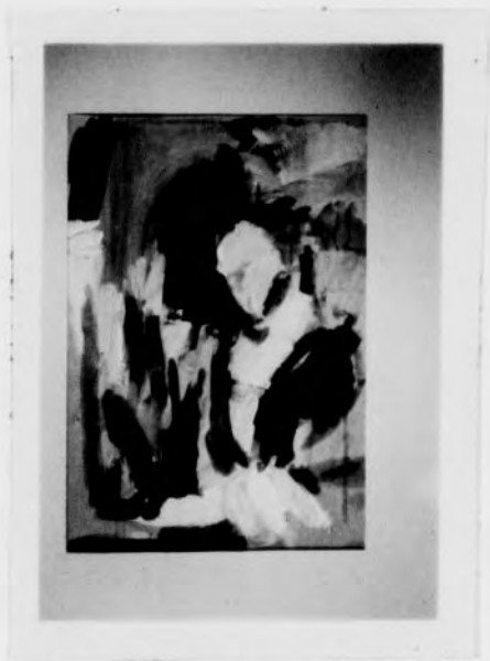
Rembrandt Saskia at a Window #1