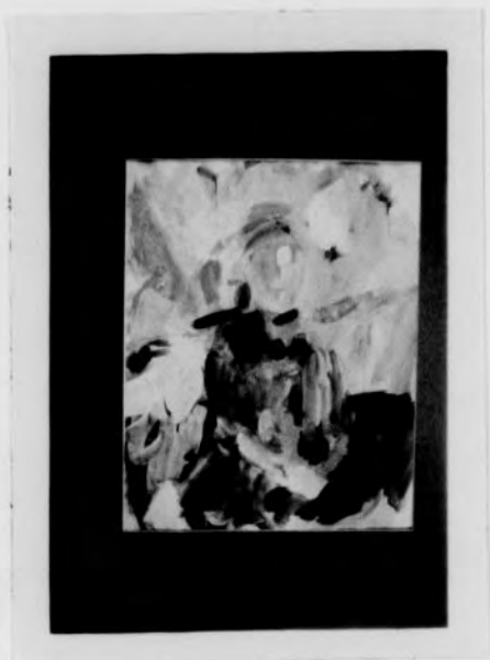
Cezanne Madame Cezanne in a Garden