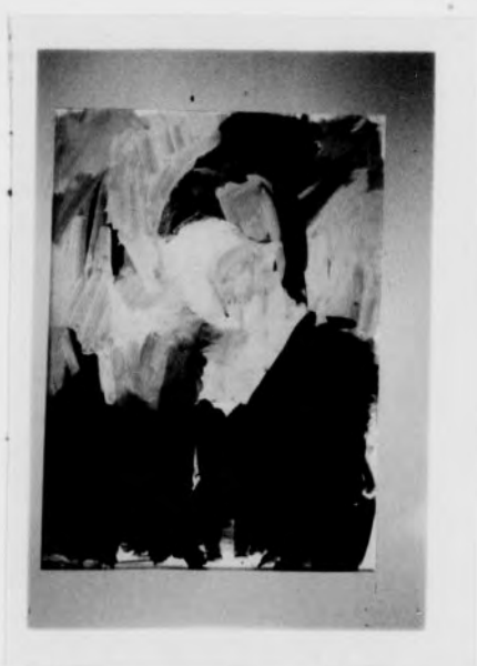
Rembrandt Saskia at a Window #2