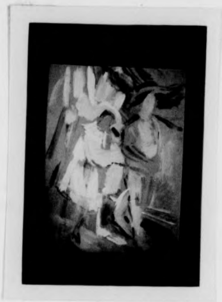
Cezanne Mardi Gras