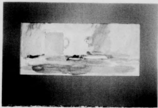
R. Bennett yellow Cup