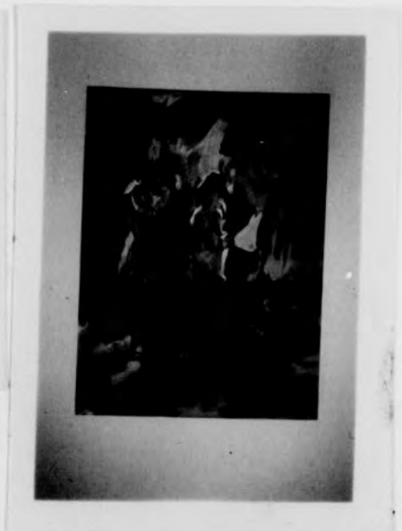
Rubens Three figures in a Landscape