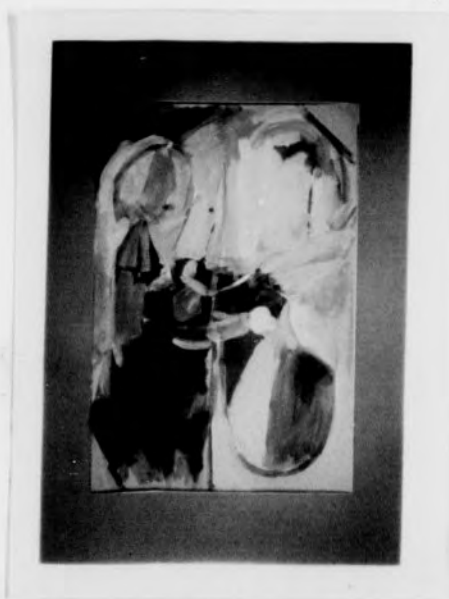
PICASSO GIRI Before a MIRROR