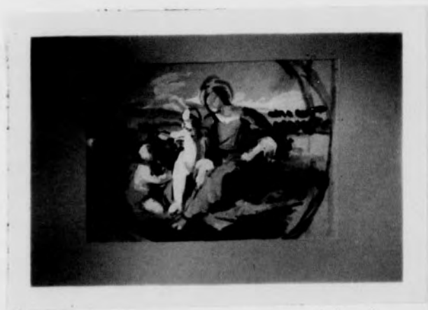
Raphael Alba Madonna