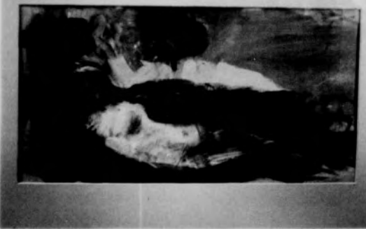
GIORGIONE Venus in a Landscape