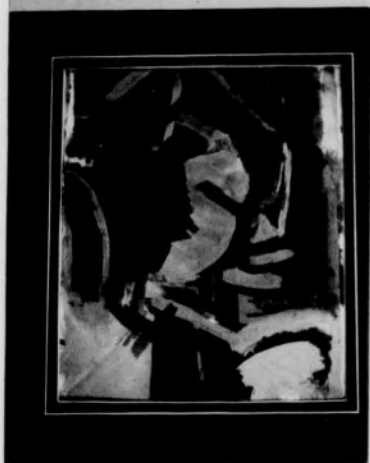
Picasso Abstract Head