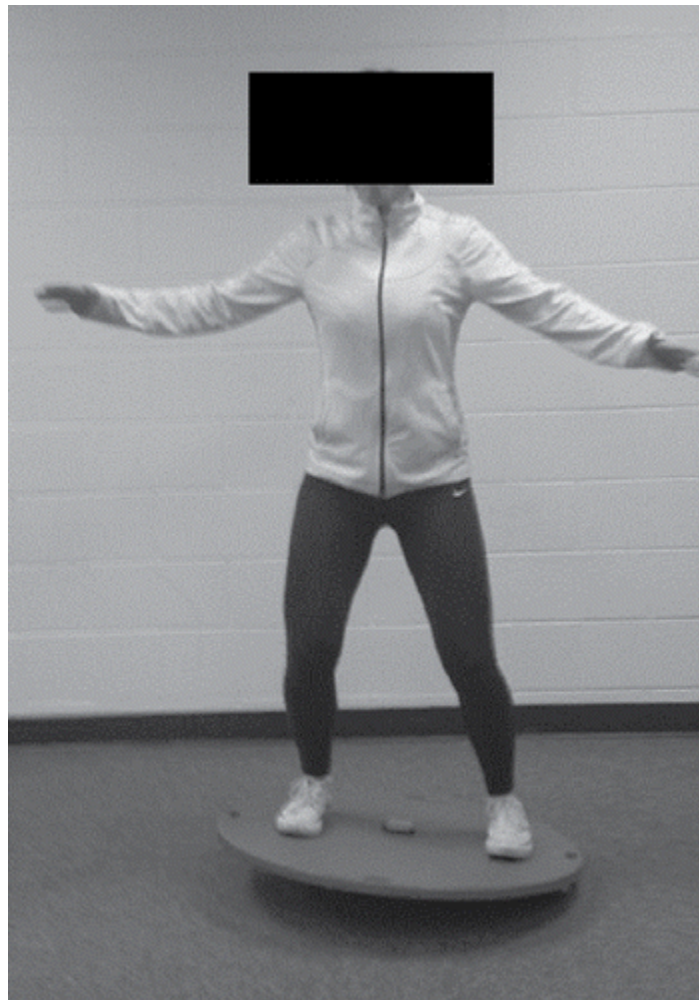
Figure 1. Participant standing on the dynamic balance board. An inertial measurement unit was attached to the center of the board to quantify balance control.

Thirty-three healthy participants (16 males, age = 23.0 \pm 3.7 years, height = 175.9 \pm 5.8 cm, mass = 74.0 \pm 12.7 kg; 17 females, age = 22.6 \pm 3.9 years, height = 164.8 \pm 6.0 cm, mass = 62.0 \pm 10.6 kg) volunteered to participate in this study. Sample size was based on a previous investigation using a balance board and attentional focus (Diekfuss et al., 2018). In that study, balance control was improved with an n of 8 using a within-subjects design. We conservatively used an n of 11 per group for a between subjects design to account for potential attrition. Inclusion criteria included no lower extremity injury in the last 6 months, and the left leg being the preferred stance limb when kicking a ball. Participants were excluded if they had: (1) a previous history of injury to the capsule, ligament, or menisci of either knee, (2) any inner ear or balance disorder, (3) undergone a previous balance training program, (4) were taking any medications that would affect balance, or (5) any neurological disorders. The institutional ethics committee approved the project and informed consent was obtained prior to commencing the study.