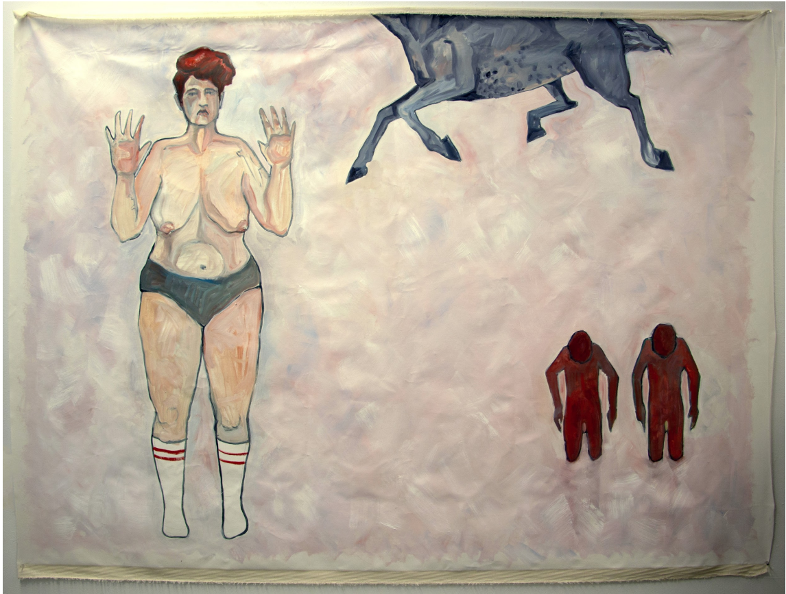
Image II. The Unicorn and the Red Lusties