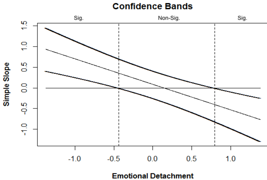
Figure 2. Regions of Significance Findings Probing the Significant Interaction of Parental Social Support and Emotional Detachment Associated with Academic Adjustment among First Generation Students.