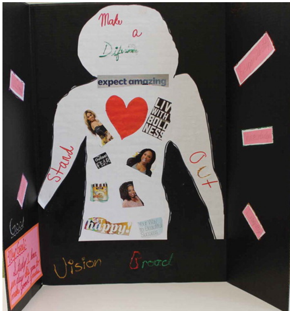
Figure 1. Vision board 1.

This section provides three photos of vision boards created by students during the summer camp. For each photo, we also provide the students' descriptions of the meaning of their boards and our own perception of how their boards are representative of common themes across other students' vision boards. The authors provide these interpretations as an example of how counselors might identify common themes and within-theme differences among vision boards to help students realize the value in underused abilities or undervalued identities.