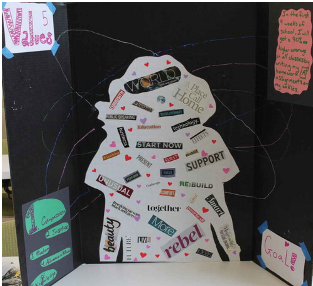
Figure 2. Vision board 2.

The creator of this vision board stated, “I want to work to bring unity to the world.” Numerous students created their vision boards with a similar focus on the importance of relationships. Some expressed a desire to serve others in their future careers as a cosmetologist, nurse, and the President. These vision boards emphasized the value of family, friendship, freedom, and justice. In general, these students expressed coherent and integrated statements about the importance of friendship and family. Some of these vision boards focused on important personal relationships. Others expressed a desire to create positive changes in the world. For example, one vision board included the words “world with new values” and “revolutionary.” Some mentioned advancement, achievement, or fame as values, but framed these qualities in terms of their impact on other people.