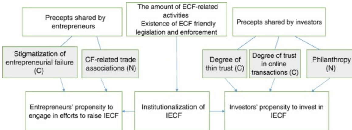
Fig. 1. Informal institutions and IECF.

The category labels are represented by the boxes in Fig. 1. We followed the coding process suggested by Thomas (2006). We read and reread the text data in order to generate the most important categories. Thomas (2006) suggested to create between three and eight categories.