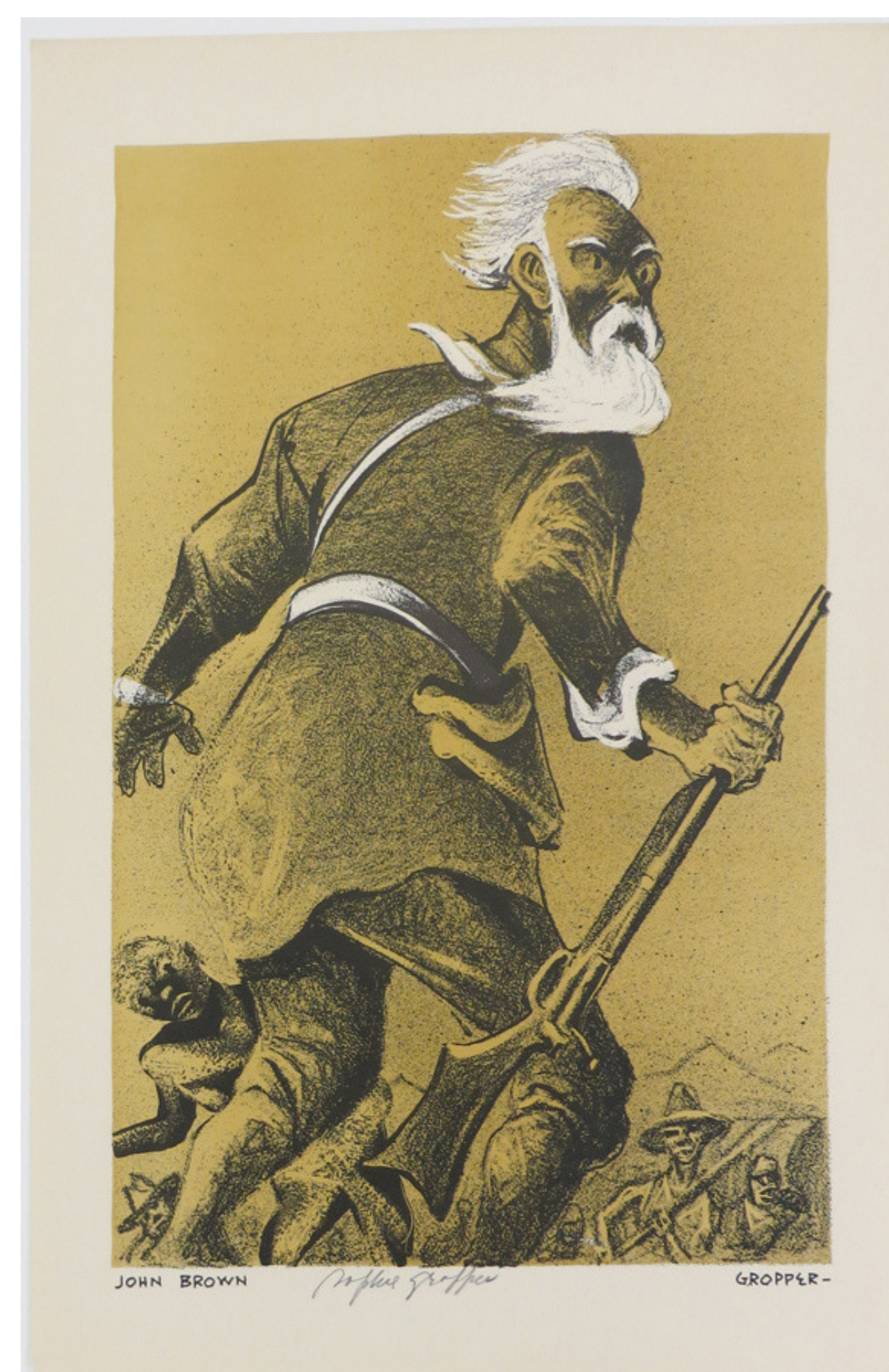
Image of 'John Brown' by William Gropper courtesy of the Weatherspoon Museum, see: http://weatherspoon.uncg.edu