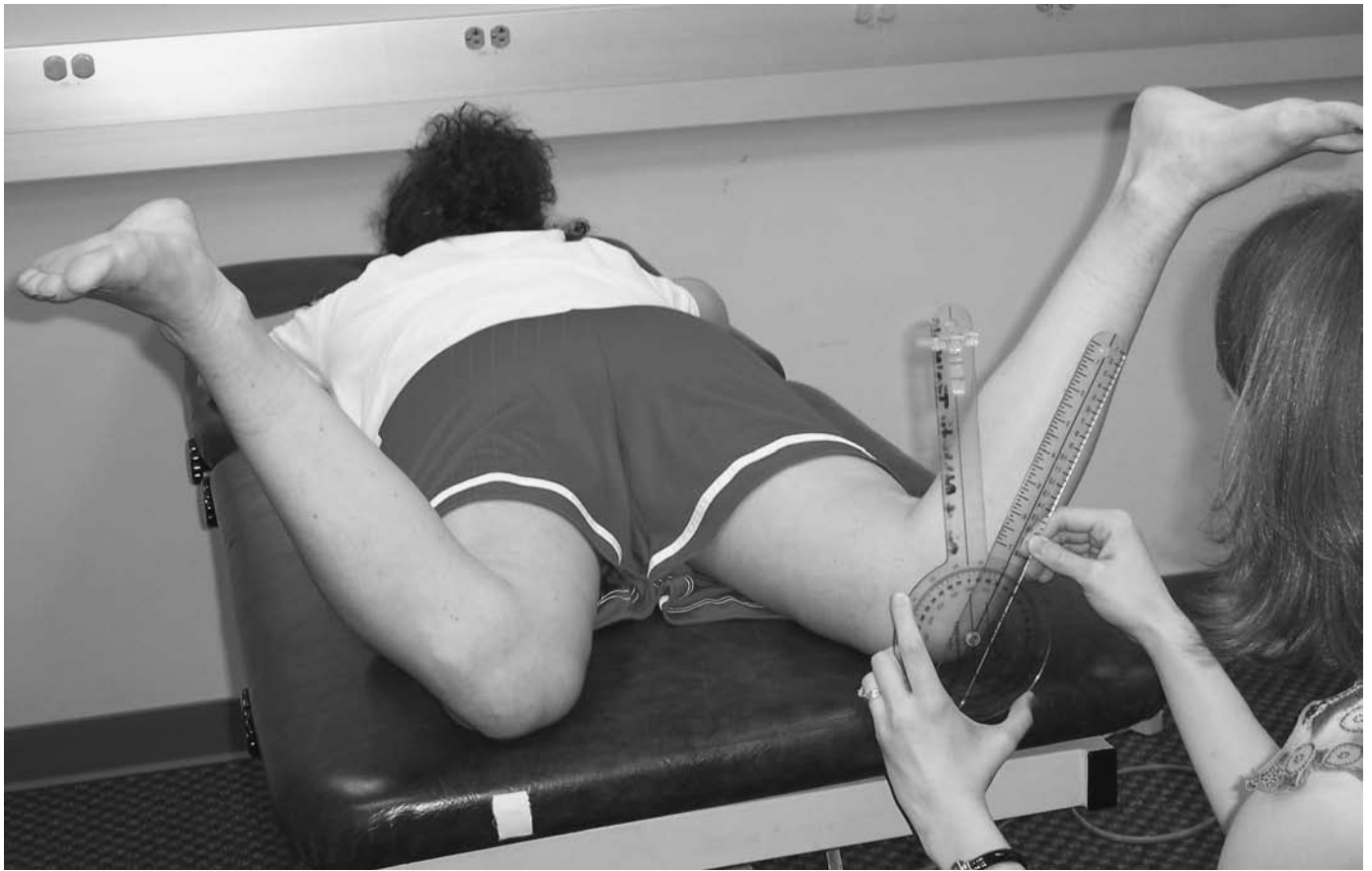
Figure 1. Measurement of hip range of motion in the prone position.