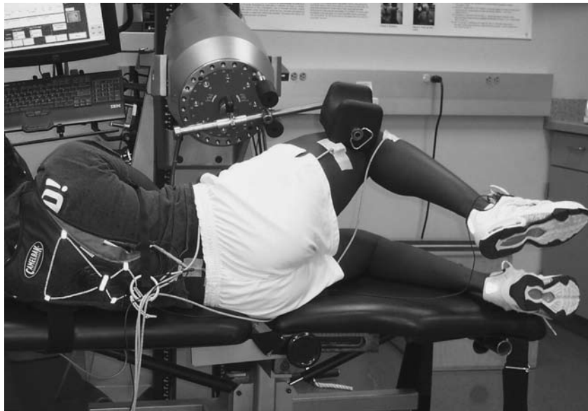
Figure 3. Hip abduction–external rotation strength test.

the response or dependent variables of interest for this study. The AUHR, RAD, sex, and hip strength were the explanatory or independent variables. Pearson product moment correlations were conducted to determine the relationship between continuous explanatory variables and hip and knee kinematics and to evaluate the relationship between AUHR and RAD. For kinematic variables for which a correlation was present, a multivariable linear regression model was used to determine which combination of factors (AUHR, RAD, sex, or hip abduction–ER isometric peak torque) were predictive of lower extremity kinematics of the hip and knee at ground contact and maximal excursion. All explanatory variables were included initially, then the models were backward reduced. The variables that contributed the least were removed at each step until all variables contributed to a concise model at the \alpha level set a priori (.05). All statistical analyses were conducted with SPSS (version 15.0; SPSS Inc, Chicago, IL).