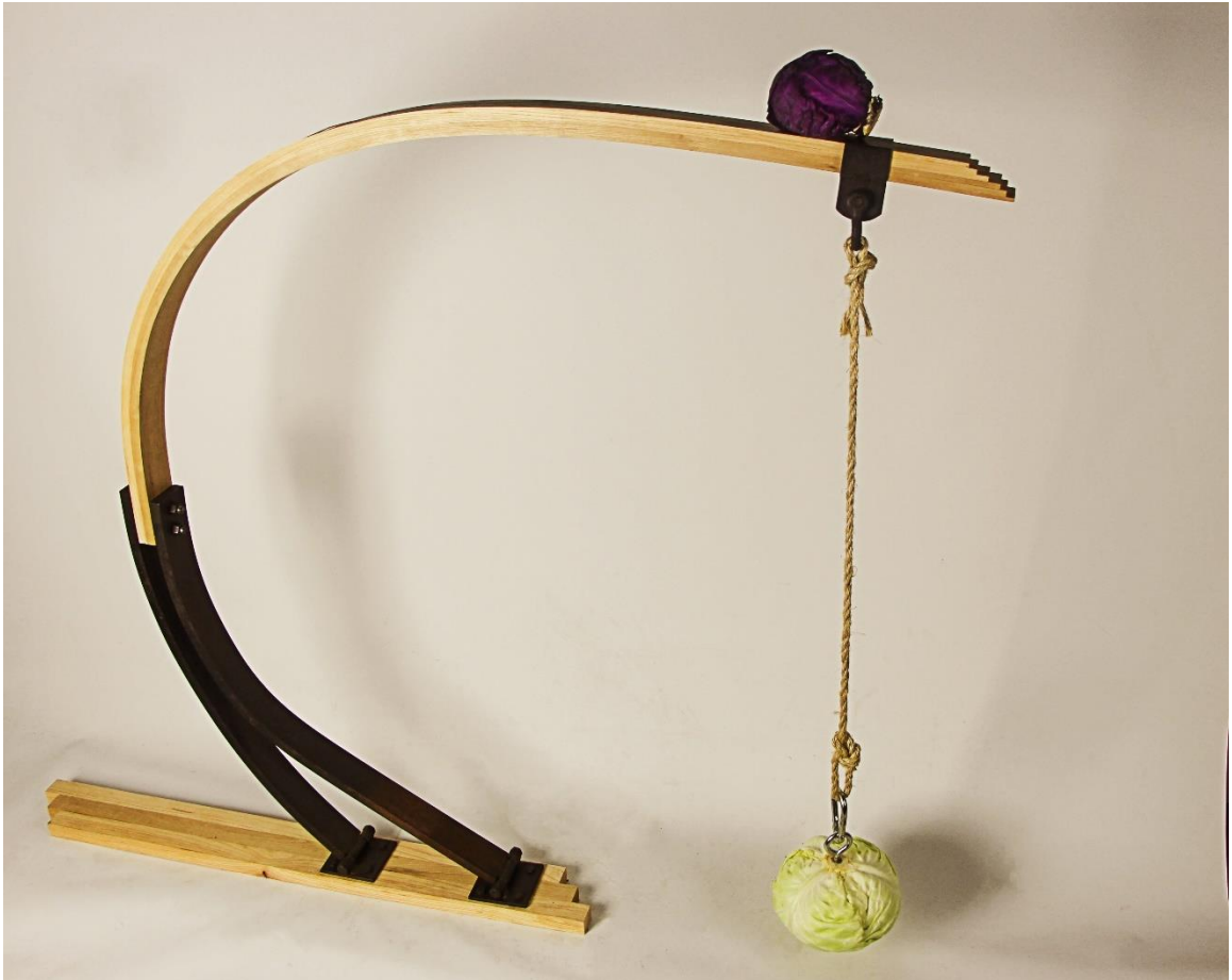
Figure 1. Counterweight