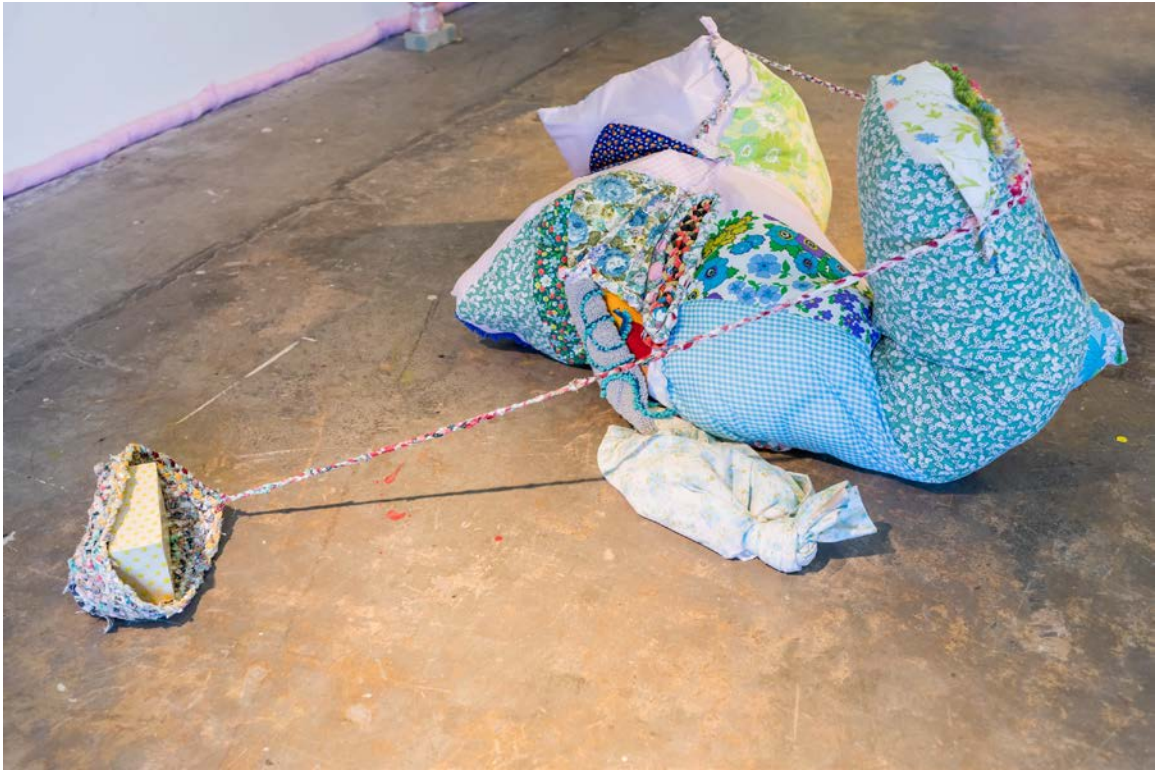
Figure 12. How can you fit a hard framework into a soft shape? II , 2018. Fabric, yarn, Poly-fil, Styrofoam, and clay, 45 x 65 x 35 in.