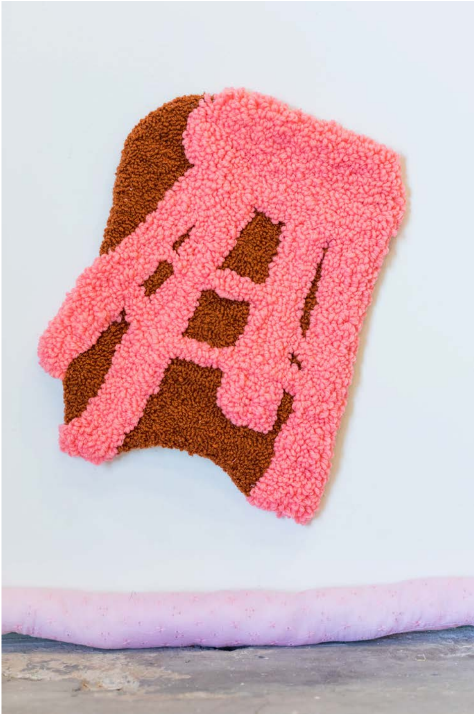
Figure 8. Beyond the shadow of a stool , 2018. Punch Rug, 18 x 16 x 1 ½ in.