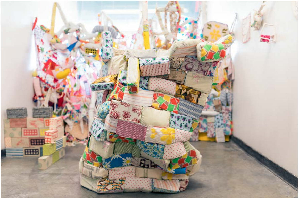
Figure 2. Anna's House of Dreams , 2017. Fabric, foam, and Poly-fil, 5 x 3 x 3 ft.