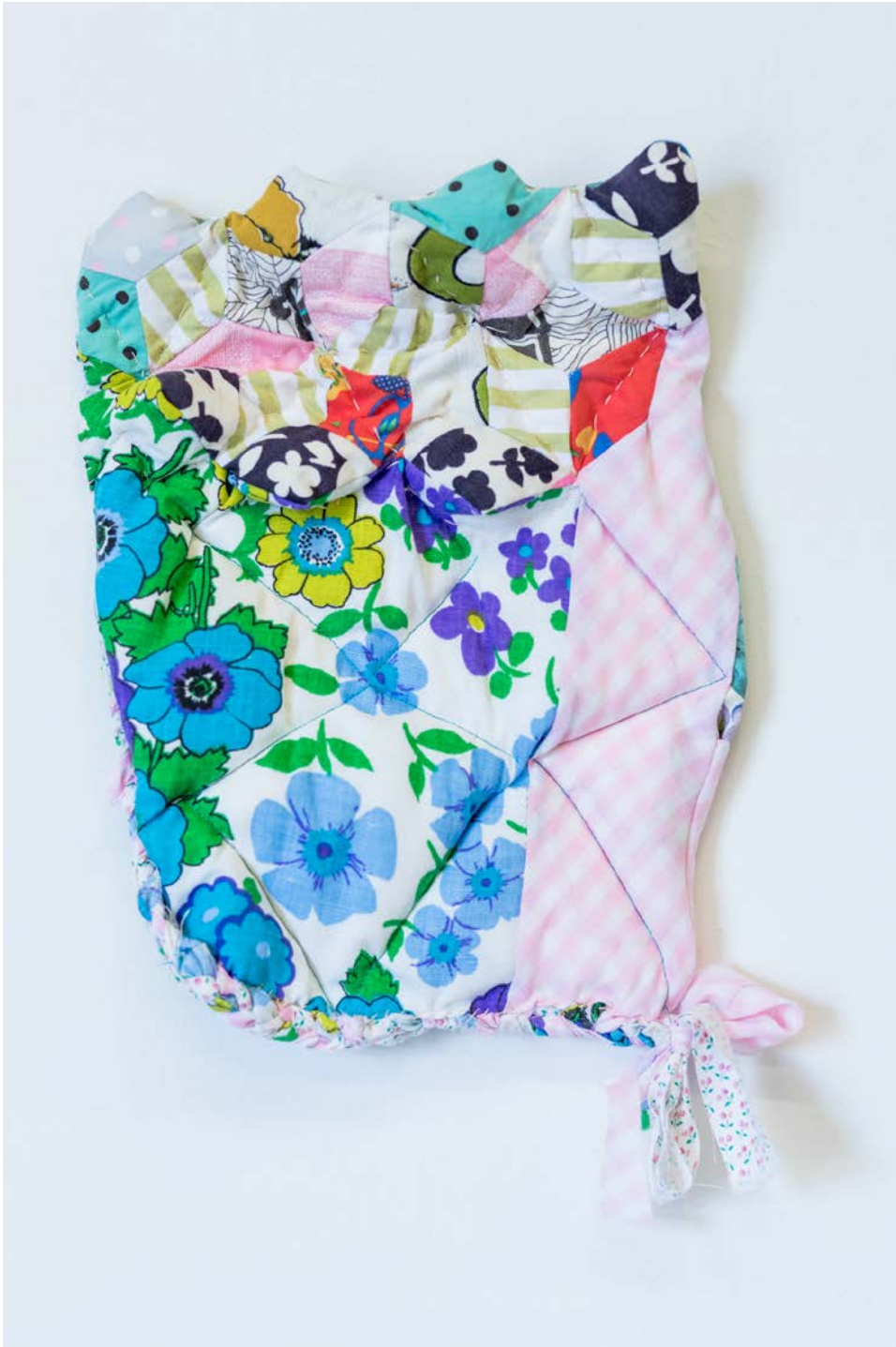
Figure 13. Quilt Painting I , 2018. Fabric and batting, 17 x 10 x 3 in.