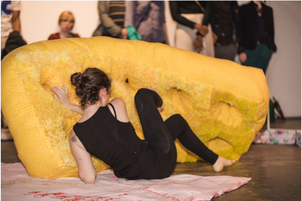
Figure 10. The Futility of Womanhood (performance still), 2018. Hook rug, fabric, Poly-fil, 3 x 6 x 1 ft.