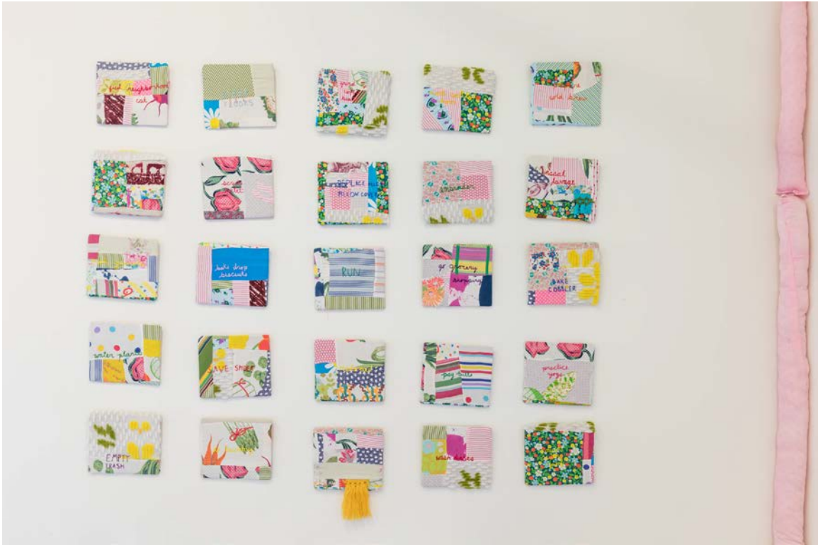
Figure 3. Acts of Domesticity , 2017, Fabric, embroidery floss, and cardboard, 8 x 9 ¼ in. each.