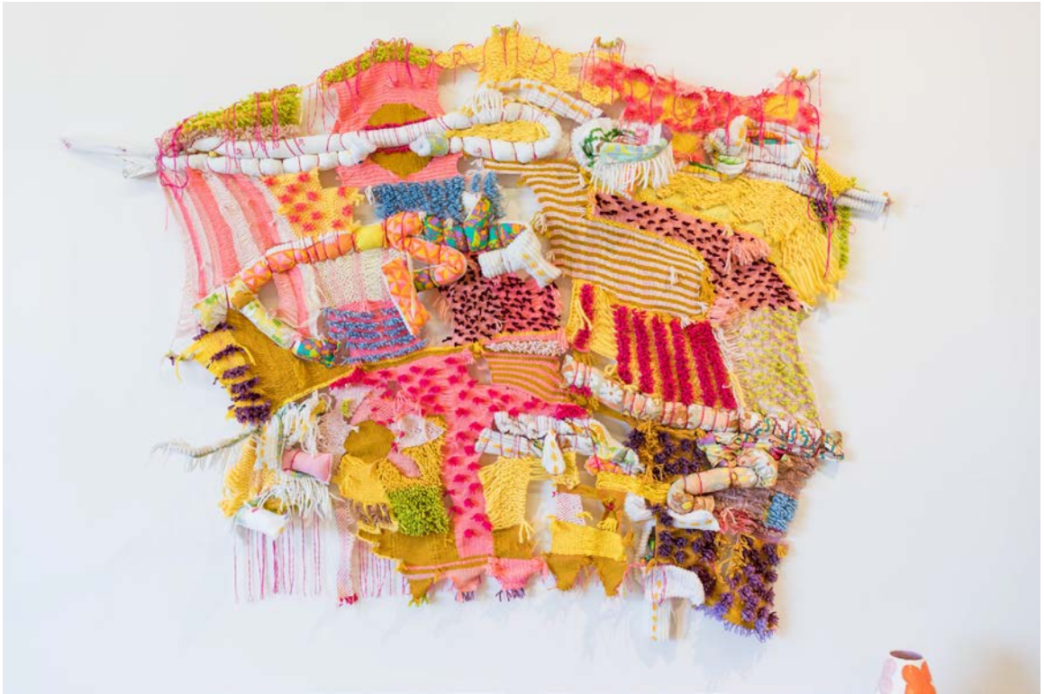
Figure 5. Electric Chain of Feeling , 2017-2018, Fabric, yarn, wire, and Poly-fil, 60 x 80 x 12 in.