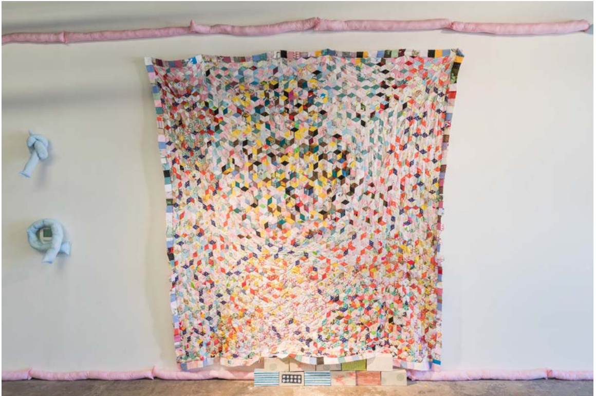
Figure 9. Quilt , 2018. Fabric, 100 x 93 in.