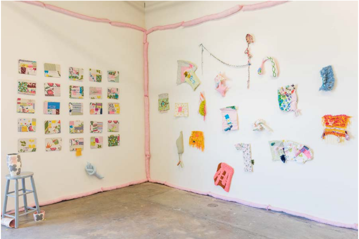
Figure 11. Busy Work (installation shot), 2018.