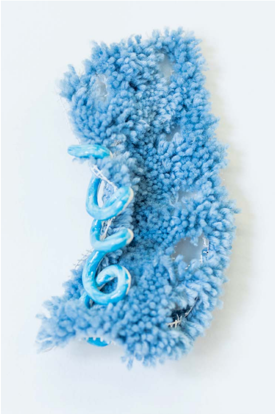
Figure 7. Blue Sketch , 2017. Hook rug and clay, 13 x 7 x 3 in.