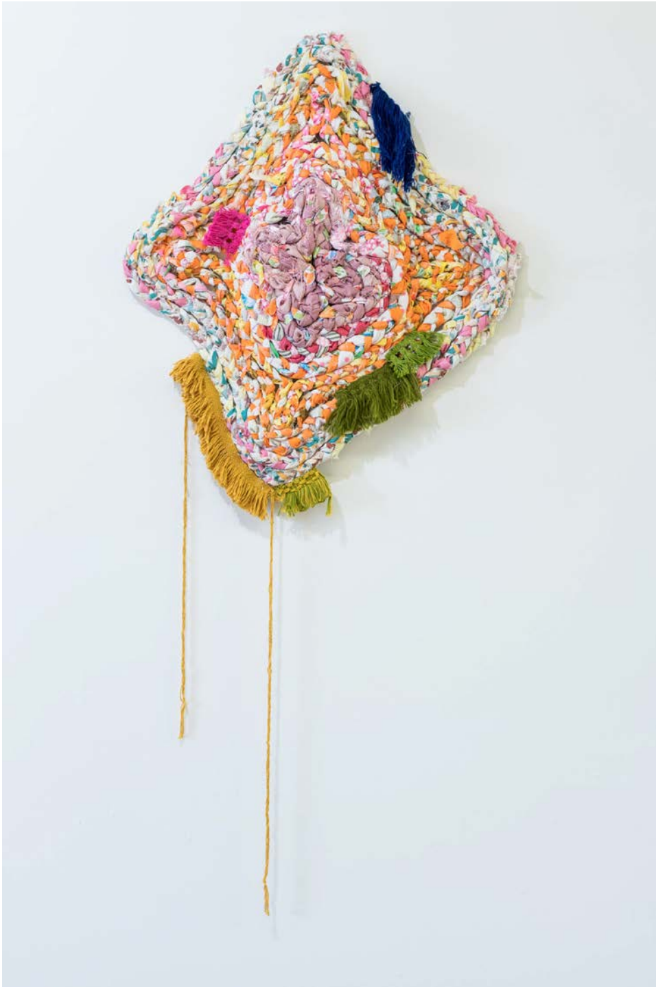
Figure 6. Rag Rug with Fringe , 2017. Fabric, 48 x 22 x 2 in.