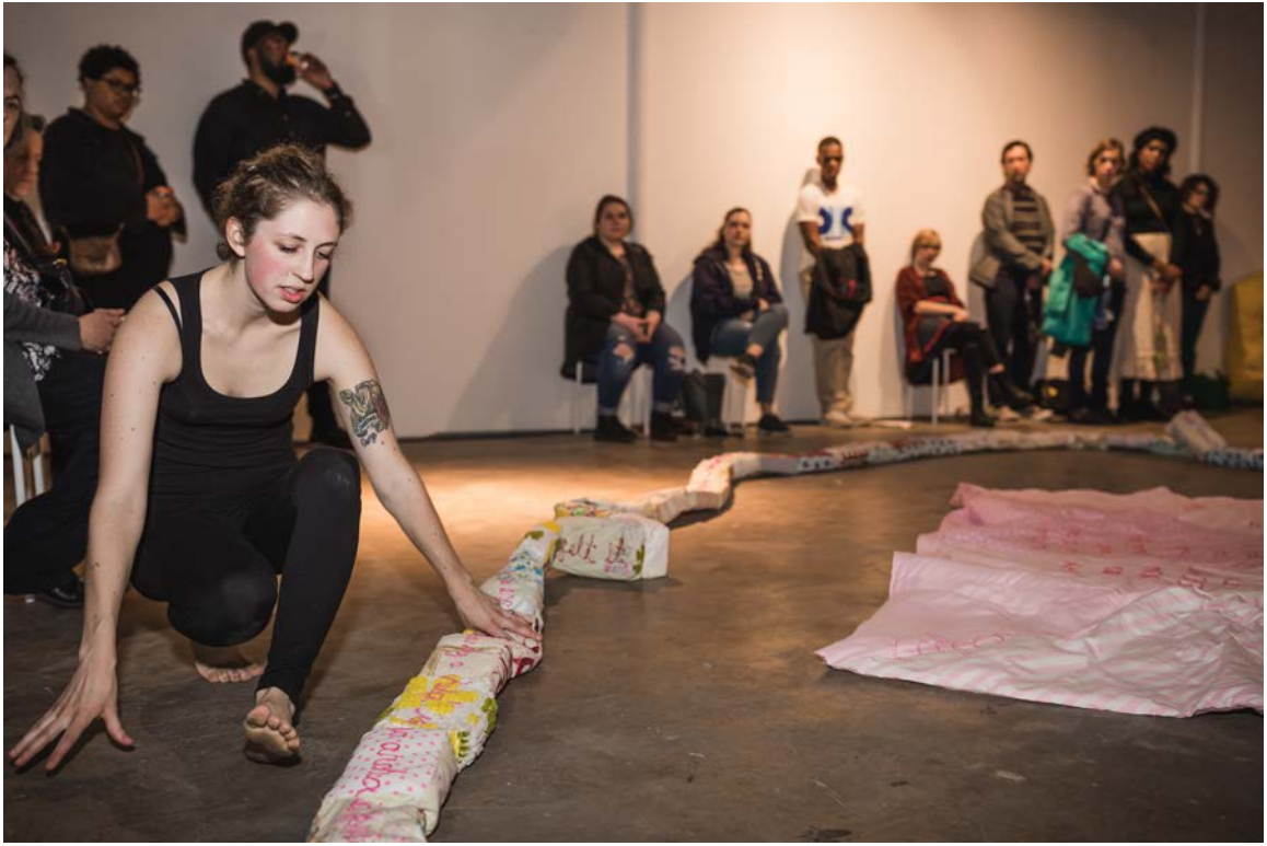
Figure 4. Diary (performance still) , 2018. Fabric, paint, glitter, foam, and Poly-fil, dimensions variable.