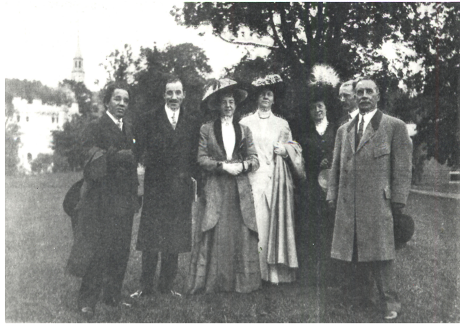
Figure 1. Powell and Taylor. 70 (Coleridge-Taylor on the left and Maud Powell, third from the left).

which pleased Powell. 68 On January 7, 1920, while preparing for a concert at Penn Theatre in Uniontown, Pennsylvania, she collapsed again. The concert was cancelled. The next morning at Titlow Hotel, the fifty-five year old Maud Powell passed away due to acute dilatation of the heart. 69