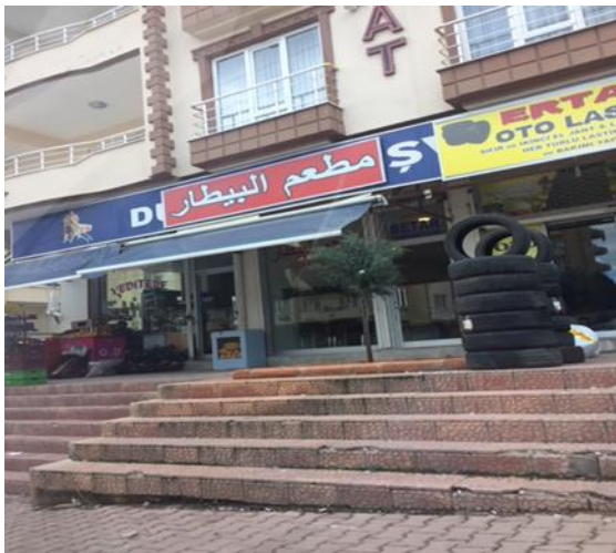
Figure 2. A family restaurant Al Baitar owned by a Syrian in Yeditepe region of Gaziantep, Turkey.

As Baban et al (2016) described, they are often underemployed; and highly skilled and educated Syrians are only able to find work in restaurants, construction, or service industries for lower wages than their Turkish coworkers. In order to prevent mistreatment of the refugees by Turkish companies, in January 2016, the government began requiring companies to offer benefits and pay of equal value to both Turks and Syrians, but as with any new government regulation, full compliance will take time. Some companies had exploited Syrian workers by not only paying low wages, but at times refusing payment, and all the while the illegal workers are subject to police raids that can result in heavy fines to Turkish business owners employing illegal workers. Frayer's National Public Radio (NPR) report from August 14, 2017 echoed Baban et al and Abboud's assertion that there are many Syrians living outside the camps and working in what Frayer (2017) described as Turkey's underground economy. Most Syrians believed their displacement would be temporary but after seven years and with no end to the war in Syria in sight, Turkey has legitimized Syrians in the country making it possible for them to obtain work permits and start their own business.