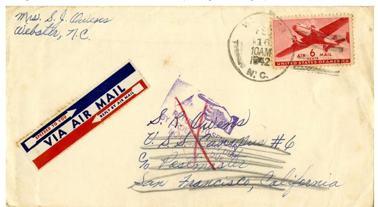
Fig.2. Owens, Frances Elvira. 02/15/42 - 1 page letter from Mrs. Owens. HL_MSS16-05_1_03_005_01_a. Samuel Robert Owens Collection. Hunter Library Special Collections, Western Carolina University, Cullowhee, NC.

HL_MSS16-05_1_03_005 also includes scanned images of the front and back of the envelope inside which the letter was enclosed (see Fig. 2 and Fig. 3).