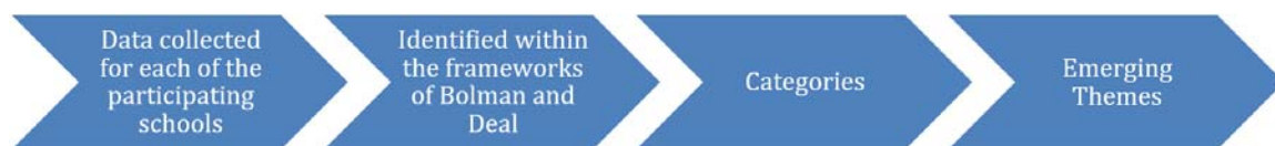
Figure 2. Data Analysis Flowchart.