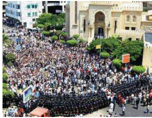
Figure 3. An Image of a Protest in the Egyptian City of Alexandria

In these posts, the producers preforms the act of reporting by providing a written or visual account of public events. Such practices represents a form of one-way communication. Communicators also can use social media to reach out to other individuals or to exchange information with multiple recipients. For instance, during the 2011 Egyptian revolution, some of the participants posted the following messages: