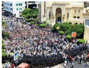
Figure 3. An Image of a Protest in the Egyptian City of Alexandria

A protest of thousands of people demanding an end to police brutality and torture passed through the streets of the Egyptian city of Alexandria on Friday