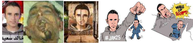
Figure 1. Selected Snapshots from Social Media Dataset

Said was submitted multiple times and to multiple social media sites throughout the social movement process, with different messages and different forms of representation (see Figure 1).