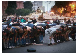
Figure 15. A Video of Christians Protecting Muslims during their prayers in Tahrir Square – Egypt

The collective interpretation among many Egyptians in regard to the problems in the country, together with the solution that put forth the idea of political change, formed a stable cognitive basis that bonded social movement participants together and generated a structure that supported their social cohesion and solidarity. At the same time, this mutual interpretation was an important source of trust evolution, translating their connections in the virtual platforms into stable ties that facilitated their collaboration. Many social media text, images, and video during the Egyptian revolution reflected the strong community structure that underpinned the social movement. This community structure was reflected in the use of words like "brothers and sisters" to refer to protesters, as in the following post: "Please pray for our brothers and sisters." This post highlights how the weak connections among people initiated on the web can grow to become strong ties and forge close relationships that are effective in organizing a social movement for political change. Another post, referring to the following video that featured Christians protecting Muslims in Egypt during their prayers in Tahrir Square during one of the protest events, stated the following: