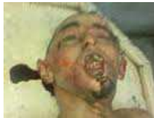
Figure 7. An Image of Khaled Said in the Morgue

The collaborative reporting that was supported by social media emphasized its important role during this phase as an independent press, resistant to state control and an important source of a unifying reality. For instance, the case of Khaled Said provides a noteworthy illustration, as it became a symbol of the 2011 Egyptian revolution. Although the Said case was not the only event that highlighted the regime's repression and abusive practices, it was an incident that moved everyone in Egyptian society and became popular because of the photo of him being tortured. The photo below of Khaled Said, which was published online, was used to break the news of his death, despite the neglect and minimization of the importance of his case by the local media.