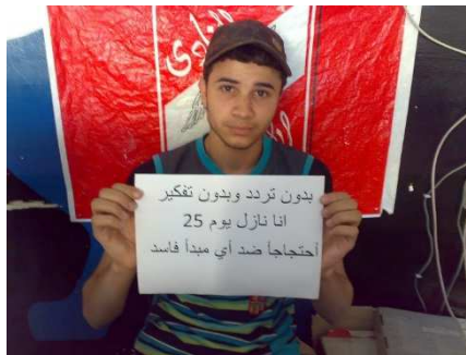
Figure 14. An Image of a Citizen Reflecting his Protest’s Participation Plan

the movement. In response, many Egyptians posted texts, photos, and videos informing others that they were joining the movement, and appealing to fellow citizens to join in the protests to demand their rights. One of the citizens, for instance, posted the following image of himself, holding a paper that reads (in Arabic): Without any hesitation or thinking, I am joining on the 25 to protest against any principle of corrupt.