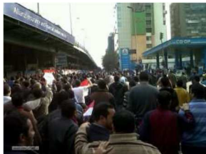
Protesters in Dokki on there way to join Ta7rir protest.

This communication activity highlights a very important strategic aspect to sustain collective action participation and maintain the social movement, since the autocratic regime of Mubarak tried many means to inhibit the circulation of the protests' information in an effort break up the revolution. The ability to rapidly disseminate and receive detailed onsite information and up-to-date feedback provided instant coverage during the different cycles of the demonstrations and improved the performance of the collective action strategy in different ways. For instance, reporting protests played an important role in increasing participation in collective actions. During the Egyptian revolution, social media was the prime tool to provide citizens with real-time news about the different uprisings in Egypt's cities and areas. In these posts, Egyptians used text, images, and videos to share news and information about the progressive events of the protests: