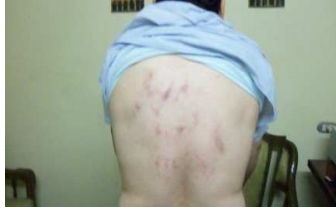
Figure 6. An Image of the Back of an Egyptian Showing Signs of Trauma

This is an example of posts that were produced by the users to provide accounts of their experiences or share information with other citizens about events in which they were personally involved. Posts like these revealed the extreme cruelty of the country's laws that supported such practices and shed light on problems that were rarely reported by the controlled-media outlets.