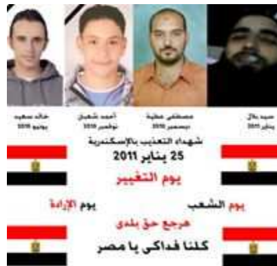
Figure 13. An Image of Police Brutality’s Victims in Egypt

Posts like this helped to establish Egyptians' homophilic connections, which were built on their shared experience. Activists then capitalized on these relationships to influence the perception of the risk associated with their social movement and then inspire further engagement. The following post is an example: “PEOPLE – UNITED – WILL NEVER BE DEFEATED!” Another post made this idea even clearer when it stated: