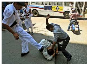
Figure 5. A Photograph of Egyptian Policemen Hitting a Citizen

Images are easier and faster to produce and understand compared to text. As an illustration, the following post was produced and circulated by citizens in social media sites. The image below, which embodied Egyptians' experience of violence, provided an example that suggests something unique about the power of images and the battle of meaning.