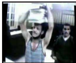
Figure 4. A Video of Police Violence in Egypt

( https://www.youtube.com/watch?v=s0hywxpH6pA ) was created to provide a spectacle of police violence, both physical and verbal, against Egyptian citizens.