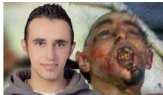
Figure 8. An Image of Said Before and After the Police Attack

We will let you see Khaled's photos before and after the attack and let you judge yourselves: Does the following photos show that Khaled really died from swallowing something or was he killed from the banging of his head against several solid objects and the kicking and punching by the two policemen and as the many eye witnesses confirmed?