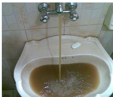
Figure 9. An Image of a Flow of Water in a Bathroom Sink

Sometimes, citizens who were interested in the country’s issues went a step further by submitting materials and initiating discussions around their posts by inviting people to share their opinions. For instance, the following image displayed a flow of brown water instead of clean water from a faucet in a bathroom sink.