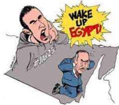
Figure 12. A Cartoon of Said Calling Egyptians

post employed social movement meanings to encourage others to be part of the change. Another example that was disseminated was a political cartoon of Said with #Jan25 written on his t-shirt screaming a wake-up call to all Egyptians for a complete change to happen.