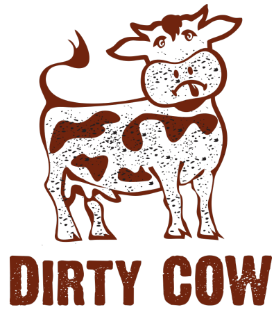
Figure 3.5: CVE-2016-5195 (Dirty Cow) Logo [3].

is run from memory; therefore the shell, and consequently any commands executed within the shell, leave no physical or electronic trace.