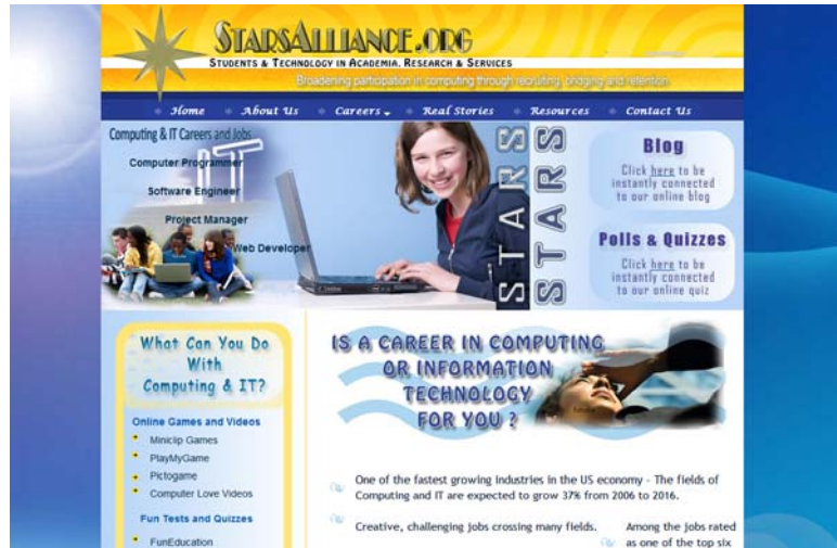
Figure 6. Revised high school design v.75

Students thought the site was “professional,” “clean cut,” “attractive,” and incorporated effective graphics. They did find, however, there was a lack of clarity in terms of the site’s purpose and a need for more color. Revisiting the table of best practices, three of the four factors were present in the new design: interactivity and social networking, graphics emphasizing photographs along with a clean “uncluttered” design, and limited text for easy scanning.