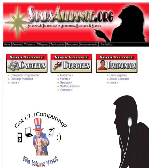
Figure 3. Middle school test site v.1

version of the middle school test site, which emphasized the use of bright colors and images intended for a middle school-age user.