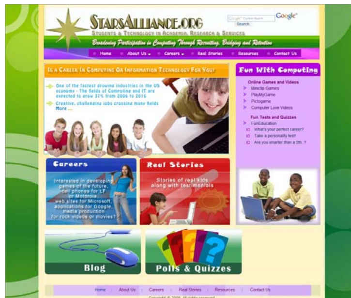
Figure 7. Middle school redesign v.75