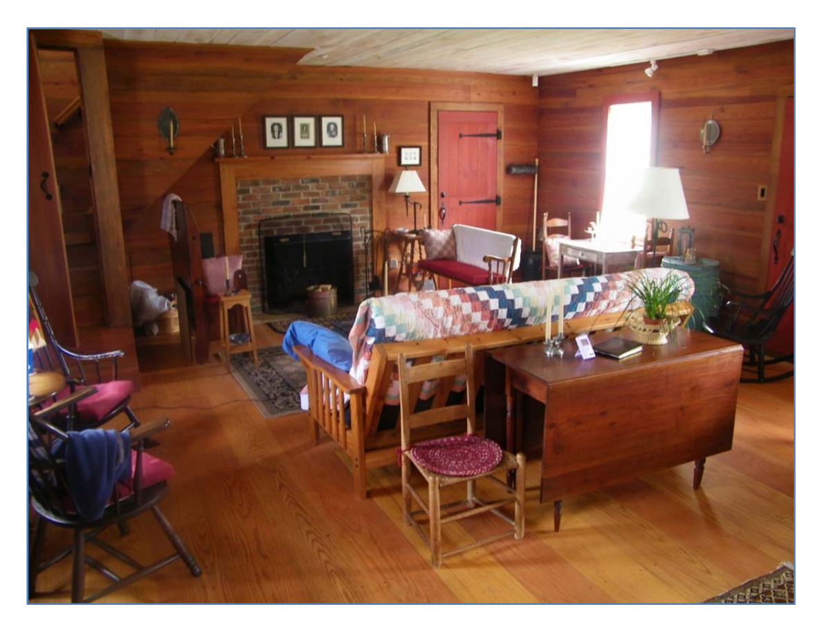
The first floor "keeping room" of the reconstructed Brooks house. Dawn Gilmore researched the color scheme and staining techniques used here. In the original house, the door on the right was kicked in by the Tories as they pursued Isaac Brooks, who climbed the stairs on the left before escaping through a window.