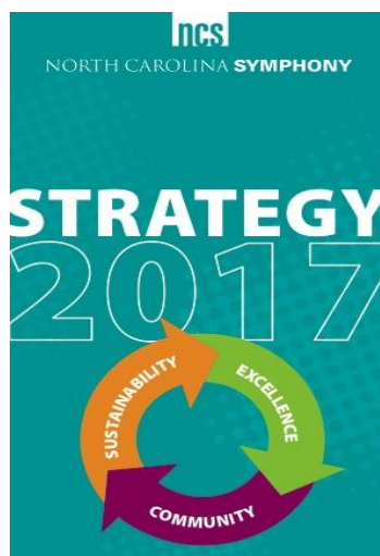
Figure 4.2. Diagram Excerpted from Strategy 2017 173

This buy-in leads to fiscal sustainability, which then produces the financial resources necessary to continue supplying the market with the desired product of high quality music and education concerts.