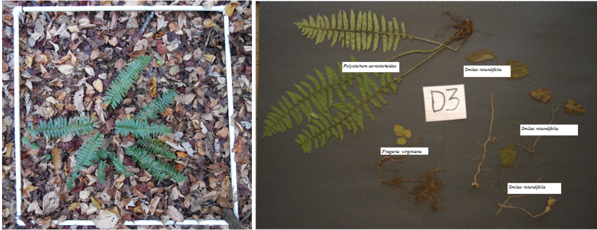
Figure 3. Example plot photograph and specimen identification photograph.

A, tract B, tract C, D2, D3) and April 10, 2016 (D1, tract E, tract F, tract G). The two samplings dates were used in order that the study survey a broader range of species.