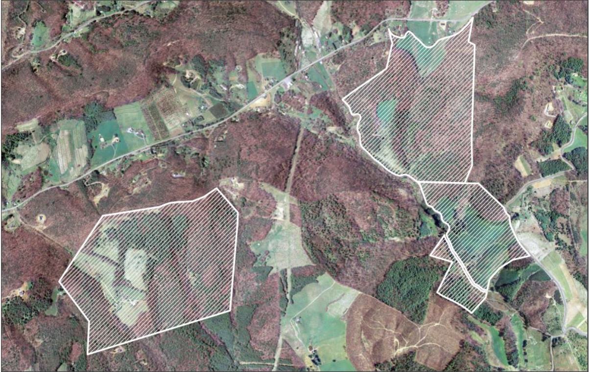
Figure 1. Appalachian State Sustainable Development Teaching and Research Farm properties.

The Appalachian State Sustainable Development Teaching and Research Farm (SD Farm) comprises two noncontiguous tracts of historic farm land in Ashe County, North Carolina. The combined area of the land is 365.39 acres. The eastern tract is slightly larger than the western at 185 acres and is almost entirely wooded but contains about 35 acres that is more open, having recently been in Christmas tree production (ENV). Almost all of the farm's current educational, agricultural, and research enterprises take place on the smaller tract, which is home to the historic farm house and various other historic and modern structures. Even so, most of this tract, about 130 acres, is also wooded. The forests were selectively timbered in the past, and Appalachian State's Sustainable Development Department has planned to practice its own sustainable timber management regime, which is beginning to be