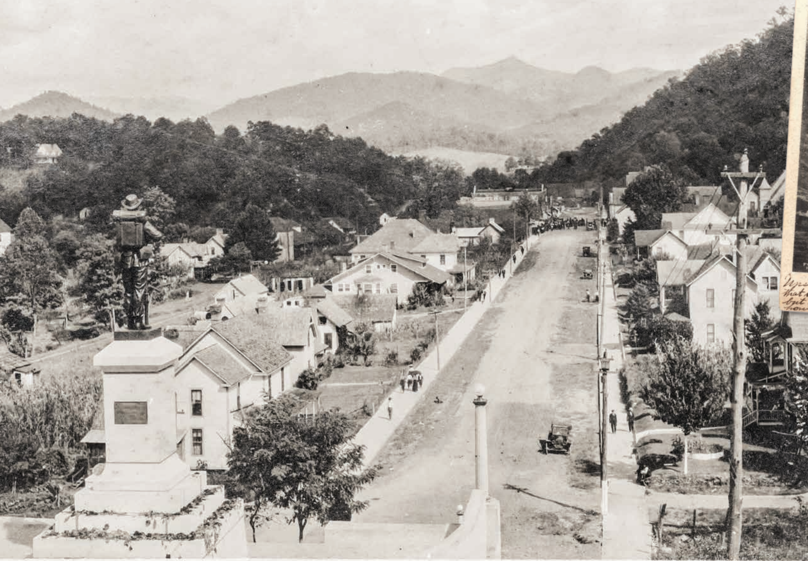
Sylva, 1915, Travel WNC Collection.