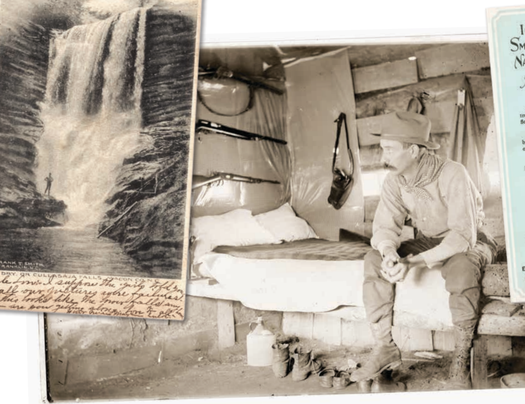
From left: Picturing Appalachia , Horace Kephart, Great Smoky Mountains – A Park for America collections.