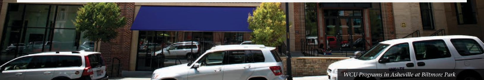
WCU Programs in Asheville at Biltmore Park

The study of Biltmore Park's library needs is supported by $27,700 in funding from the Institute of Museum and Library Services under the provisions of the federal Library Services and Technology Act, as administered by the State Library of North Carolina, a division of the Department of Cultural Resources.