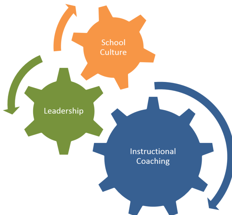
Figure 9. The Impact of Coaching Implementation.

coaching model (as described in the framework) in conjunction with strong leadership creates a synergistic cycle of continuous improvement that strengthens the school culture. Together, these components improve teacher practice and positively impact student achievement.