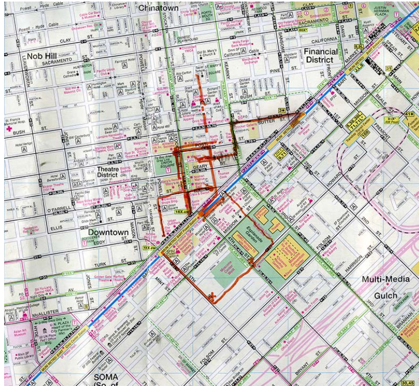
4. Can I Walk Ten Minutes with You? Lithography prints, 2014