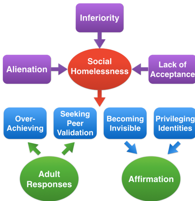
Figure 2. Theoretical Model of Social Homelessness

highlights four ways students respond to being socially homeless: over-achieving, seeking peer validation, becoming invisible and privileging identities. This theoretical model—represented visually in Figure 2—denotes the process through which socially homeless students negotiate their multi-marginalized identities in school settings.