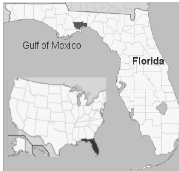
Figure 1. Site Location–Wakulla County, Florida

The area surrounding Wakulla Springs is well known for its karst topography, or landforms that have been modified by dissolution of soluble rock (e.g., limestone), resulting in a terrain that is characterized by natural springs, sinkholes, sinking and rising streams, and caves. Wakulla Spring itself is the park's centerpiece, and this particular spring is considered world class with regard to its flow and the size of the cave system that channels its flow. In 2007, after years of exploratory effort, divers connected a number of other systems in the WKP to Wakulla Spring. They entered at Turner Sink in the Leon Sinks Cave System and surfaced over 20 hours (a 6.5 hour dive with 14 hours of decompression due to 300 feet dive depths) later at Wakulla Spring after following almost 7 miles of cave passage. This established the Wakulla-Leon Sinks Cave System as the longest underwater cave in the U.S. (Kernagis, McKinlay, and Kincaid 2008). While Wakulla Spring is the most prominent feature in the park, it contains other springs as well, including Sally Ward and Emerald Spring that also have associated cave systems.