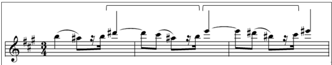
Figure 9. Triumph Motive in the A-major Piano Quartet, I: Piano Upper Line, mm. 57-59.

This figure recalls militaristic dotted rhythms and projects an underlying sense of vigor and authority underneath the wafting, imitating strings in mm. 57-59.