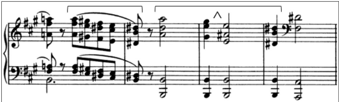
Figure 8. First Instance of Linkage in the A-major Piano Quartet, I: Piano Part, mm. 44-47.

Above the expanded motive in mm. 45-47, the strings become more legato and lyrical immediately after their second escape attempt beginning in m. 43. The strings' C# in m. 45 not only represents the local climax, but also the highest registral point for the strings thus far. Contrasting with m. 41, the end of the first