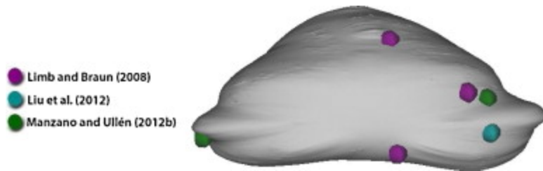
Fig. 2. Visualization of cerebellar activation foci reported in select studies of improvisation. Note: Activation foci are overlaid on an inflated cerebellum using the Connectome Workbench. A posterior view of the cerebellum is depicted.

A variety of experimental approaches and participant samples have been employed to study improvisation (see Table 1). Several notable differences in task design are apparent in the literature: while some studies contrasted improvisation with memory retrieval (Bengtsson et al., 2007 and Limb and Braun, 2008), others contrasted specific modes of improvisation, such as melodic and rhythmic (Berkowitz and Ansari, 2008, Berkowitz and Ansari, 2010 and de Manzano and Ullén, 2012a). Moreover, some researchers have been interested in analyzing the effects of musical expertise (e.g., Berkowitz and Ansari, 2008 and Pinho et al., 2014) and collaboration (Donnay et al., 2014) on brain activity during improvisation. Such methodological differences are important to consider when comparing results across studies.