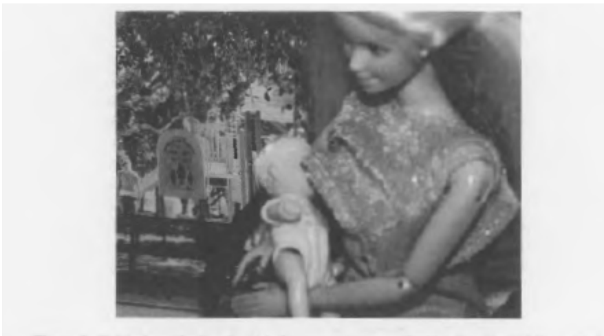
Figure 3. 'Public breastfeeding Barbie', from an exhibition, 'Barbies We Would Like to See'

I'd like to create my own video that would encdurage expectant mothers to breastfeed their babies, only my video would give them a realistic picture of the process,