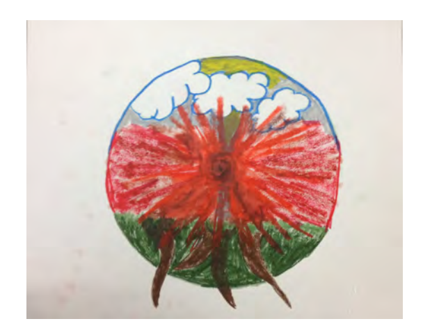
Figure 6: Body Drawing Experience