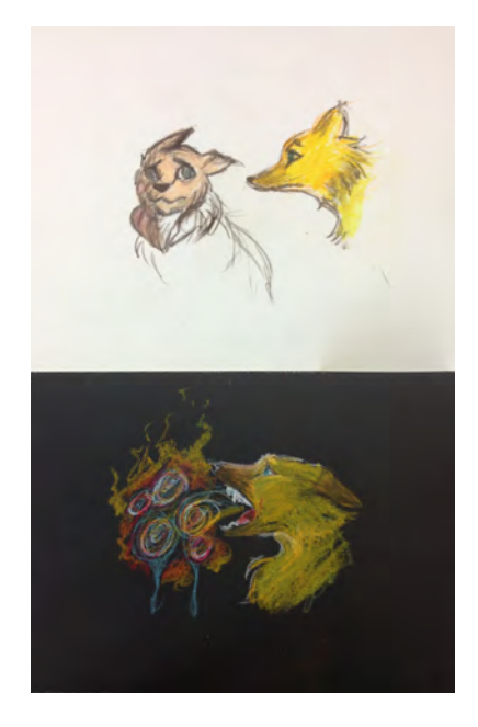
Figure 3: "Please" and "Why"