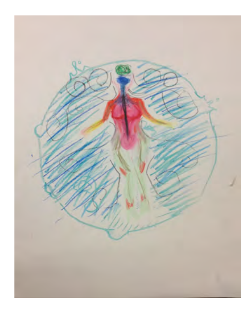
Figure 4: Body Drawing Experience