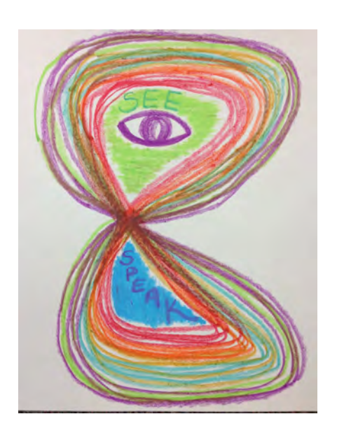
Figure 2: Body Drawing Experience