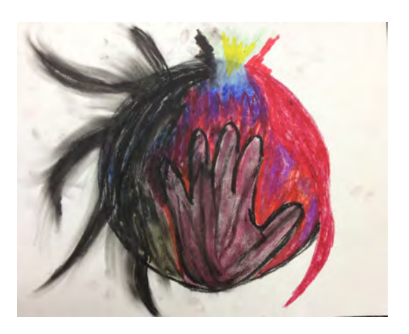
Figure 5: Post GIM Mandala