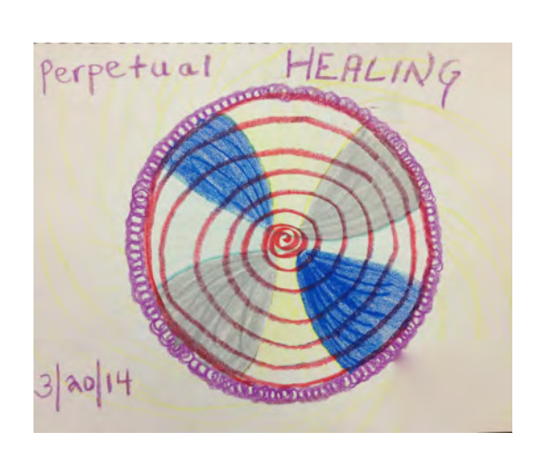
Figure 1: Post GIM Mandala