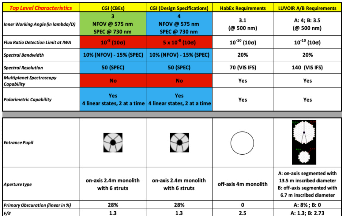
Table 1: Comparison of CGI top-level characteristics –current best estimates of performance (CBEs) as of August 2020 and design specifications – to the corresponding requirements for the HabEx and LUVOIR visible coronagraphs. For the CGI columns, the color-coding indicates whether CGI performance (CBE or design specification) is better (green), in family with (blue) or significantly worse (red) than what is required for future missions

Tables 1 & 2 compare CGI CBEs as of August 2020 – as well as CGI design specifications – to the baseline requirements of the HabEx 4m off-axis telescope coronagraph (Gaudi et al. 2019), the LUVOIR A 15m on-axis telescope coronagraph and the LUVOIR B 8m off-axis telescope coronagraph (Fischer et al. 2019). For each coronagraph characteristic listed, the color coding indicates whether CGI estimated performance (or design specification) is better (green), in family with (blue) or significantly worse (red) than what is required for future missions. Table 1 concentrates on top-level characteristics that define a coronagraph discovery space – inner working angle (IWA) and point-source to star flux ratio detection limit at that IWA – as well as the coronagraph potential for spectral and polarimetric characterization. Table 2 concentrates on lower level technical requirements.