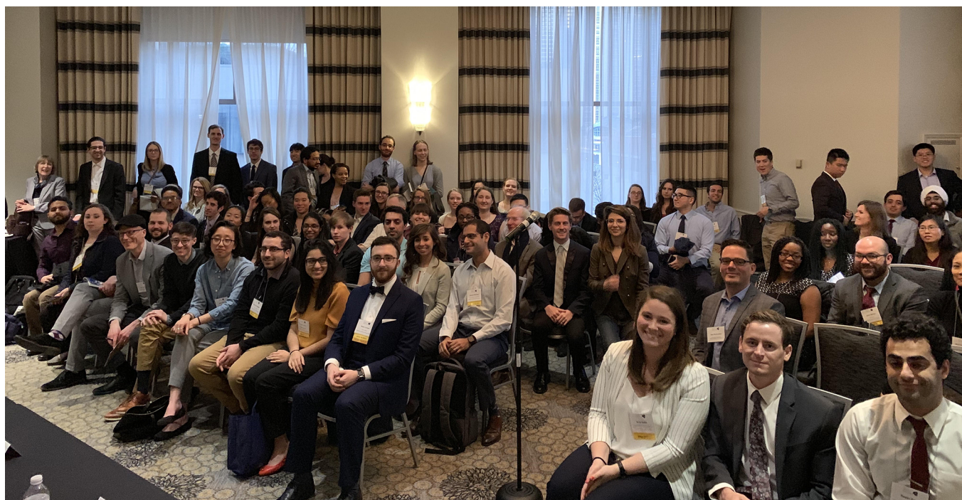
Figure 2. Physician-Scientist Training Program/Research in Residency (PSTP/RIR) question-and-answer panel from the 2019 AAP/ASCI/APSA Joint Meeting. APSA-coordinated question-and-answer panel between prominent PSTP/RIR directors and trainees at the 2019 AAP/ASCI/APSA Joint Meeting. The panel grew to standing room only and caused meeting organizers to make accommodations for multiple parallel question-and-answer sessions during the 2020 Joint Meeting prior to COVID-19 meeting cancellation. APSA will continue to facilitate communication between research-integrated postgraduate programs and trainees to improve the transparency of the application process.

trainees across the country (11). To the IRs in the audience, I will comment that your voice is respected and heard. APSA was established by trainees for trainees, and we will follow through. You are not alone. APSA is here to help.