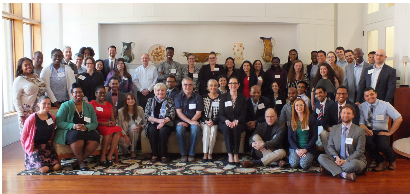
Figure 1. 2019 Physician-Scientist Trainee Diversity Summit. Image of stakeholder participants from APSA's Physician Scientist Trainee Diversity Summit, held on June 21 and 22, 2019. Participants included representatives from the NIH, Burroughs Wellcome Fund, AAP, ASCI, and AAMC, as well as associate deans of diversity, dual-degree program directors, invited faculty speakers, and current trainees. APSA seeks to organize a follow-up conference in summer 2021.

balancing clinical responsibilities, and as such, the transition from resident/fellow to independence is an especially vulnerable time. Recognizing this particularly challenging time for trainees, APSA began a new Resident, Fellow, and Junior Faculty Committee in 2019. Since its inception, the Committee has developed new postgraduate programming for APSA regional meetings and the Annual Meeting, has coordinated an early career physician-scientist research value unit survey to ask how deans and department heads incentivize research and discernable outcomes on faculty retention, and is currently developing a prospective longitudinal study of graduating resident, fellow, and junior faculty to evaluate factors that facilitate research retention versus attrition.