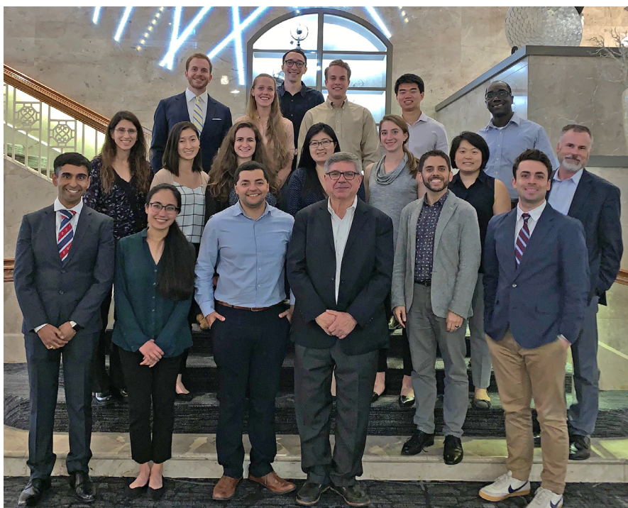
Figure 4. 2019–2020 APSA Executive Council.