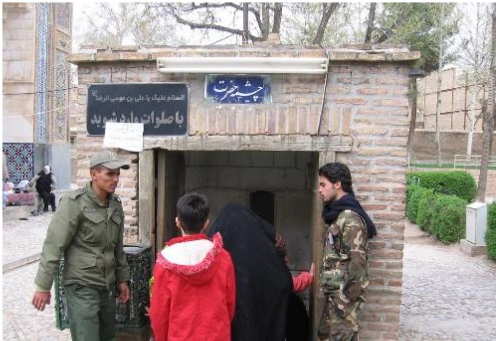
Figure 5: The sign to the top left of the doorway reads "Enter with the salavāt " at the qadamgāh of Imam Reza near Nishapur.

hands on the sign that calls for the salavāt while whispering the correct response under their breaths, making tangible in physical form the gravity of both the occasion and of the place.