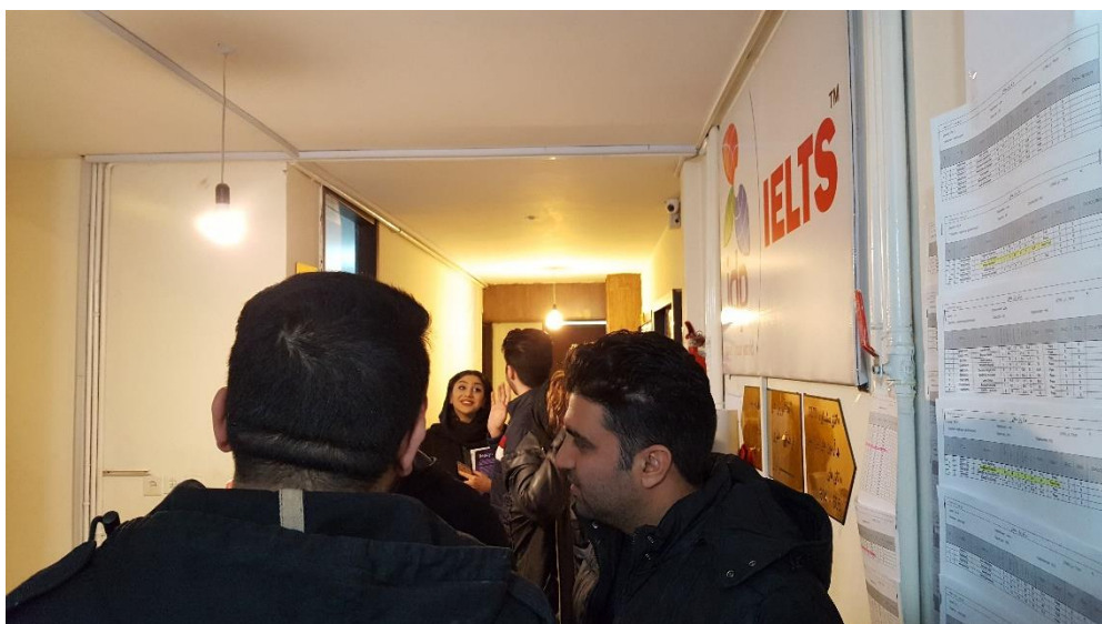
Figure 3: Students crowd into a hallway and chat amongst each other while they wait for a class. To the right lie the exam results.