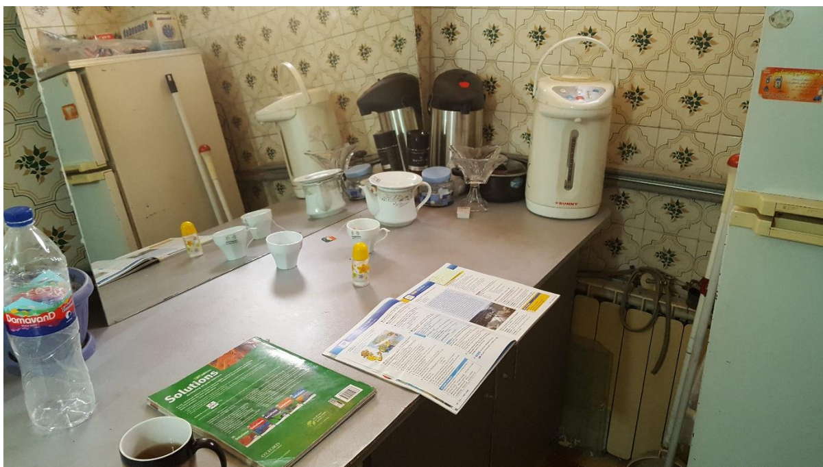
Figure 1: Getting ready for class in the institute kitchen (Author's image)