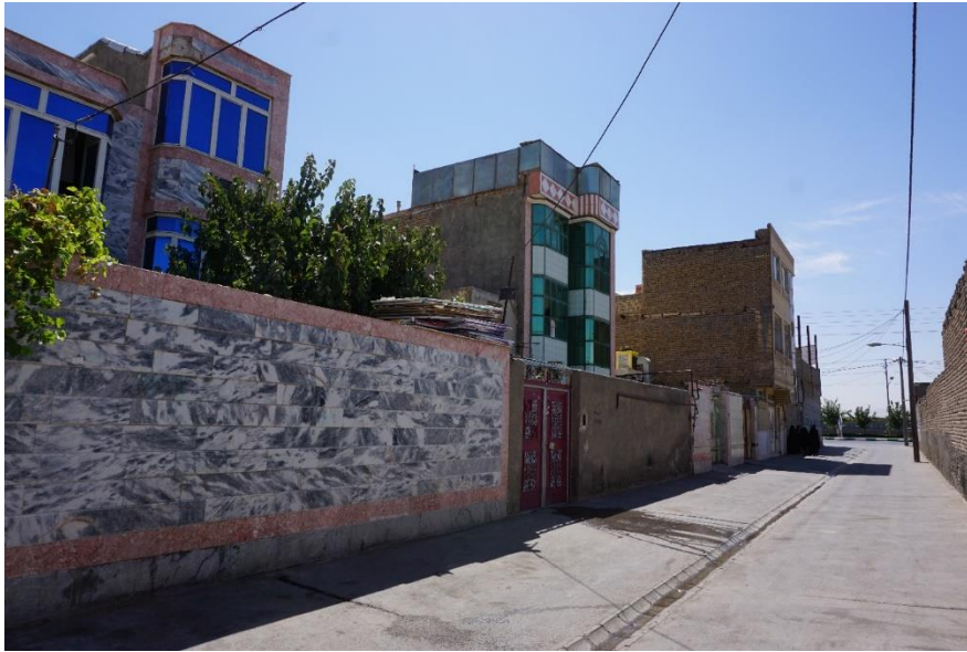
Figure 7: The location of the school in Qal'e-Sākhtemān. Its relatively straight streets, tinted windows, and marble facades were evidence that it was more 'bā kelāss' than Qal'e-Khiyābān..

The upper floor was divided into three rooms – a small administrative office, a small classroom (see Figure 8, a large multipurpose kitchen and open-space area, allocated for arts, craft, and theatre. There were approximately twelve girls aged 7-15, all without the shenāsnāme – the children of unions of Afghan fathers and Iranian mothers, said to have been abandoned by their fathers. Without the identity card, access to education was patchy and uncertain, despite recent undertakings by the Supreme Leader that all Afghan children should be able to enrol in school in Iran 182 . In addition to the children, there were three adult women present. One of them, Mrs Mirzāyi, drew a small salary from her work with Friends of the Children, having previously been unemployed. The other two volunteered their time to administer the centre and teach the children. Like the services provided, much of the material for the school – notebooks, seats, educational materials, etc. had been provided by donation from members of Friends of the Children. Donation of such material was largely unorganised, members supplying what they could, when they had the opportunity.