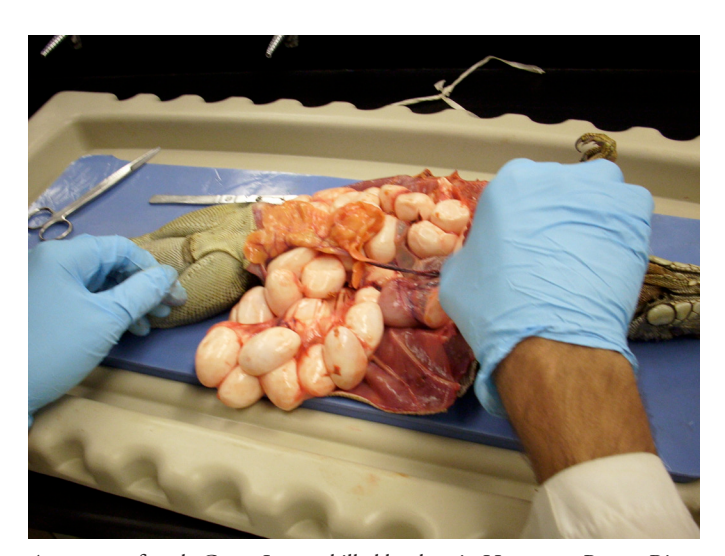
A pregnant female Green Iguana killed by dogs in Humacao, Puerto Rico. Of 69 eggs, 55 contained developing embryos.