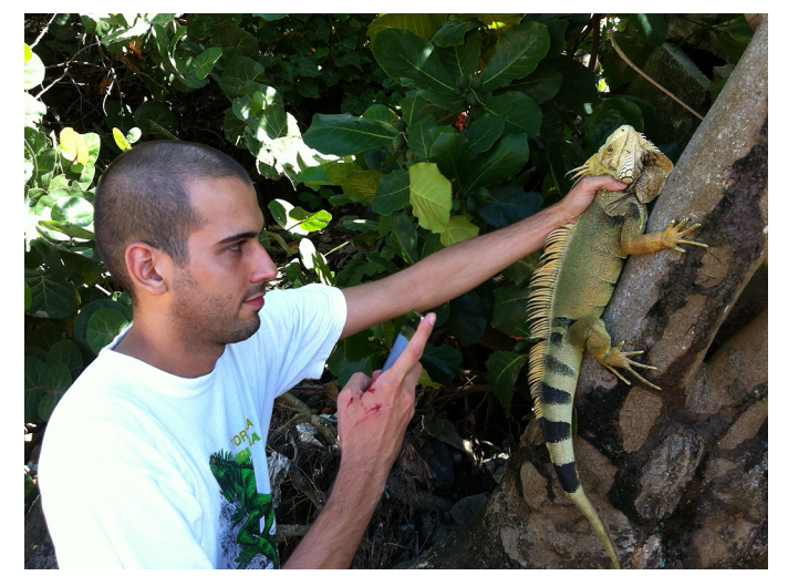
This male Green Iguana was captured by the senior author in the Piñones State Forest in Loiza, Puerto Rico. Note the wounds inflicted by a large lizard equipped with teeth, claws, and a tail that can be used like a club.

Jackknife of test gain, and Jackknife of the AUC, and selected the combination of layers that resulted in the highest mean, training, and test AUC values. These layers included the annual mean temperature (BIO1), isothermality (BIO3), temperature seasonality (BIO4), minimum temperature of the coldest month (BIO6), the mean temperature of the warmest quarter (BIO10), the annual precipitation (BIO12), precipitation seasonality (BIO15), and the precipitation of the warmest quarter (BIO18; for clarifications on the definitions, refer to http://www.worldclim.org/bioclim).