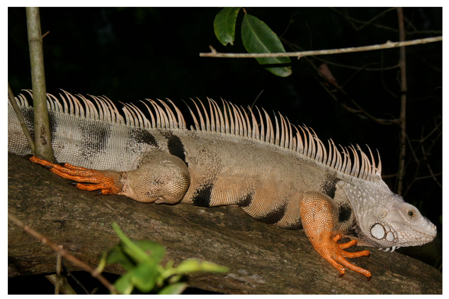
This Green Iguana has taken up residence at the "Paseo Lineal" in the Central Park of San Juan, Puerto Rico.

vulnerable to invasions of I. iguana across the Greater Caribbean Basin.