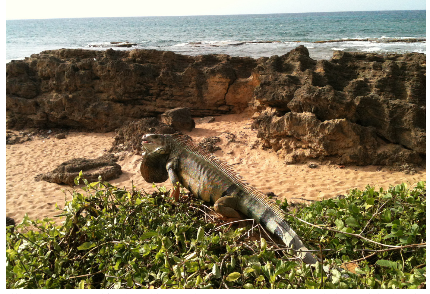
Although this iguana is reacting defensively toward the photographer, many Green Iguanas become accustomed to humans and often allow a close approach. This individual was basking near the Piñones State Forest in Loiza, Puerto Rico.

pixels within the range of the MTeS+S minus 1 standard deviation (MTeS+S -s). This was done to consider the lower level dispersion from the mean threshold value obtained from the 10 replicates, since some combinations of points yielded a lower threshold value for the presence-absence cutoff point.