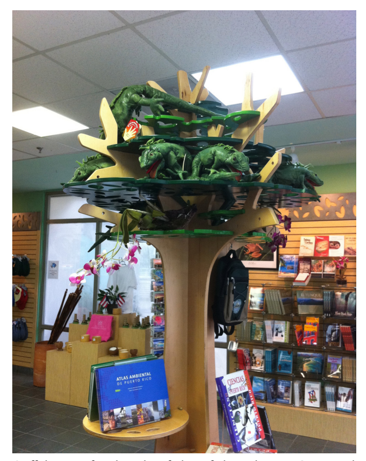
Stuffed iguanas for sale in the gift shop of El Portal Visitor Center at El Yunque National Forest. Although not native and highly invasive, because of their visibility, Green Iguanas have come to represent wildlife for many tourists visiting Puerto Rico.

Currently the possession and importation of Green Iguanas is regulated depending on the jurisdiction where they have been