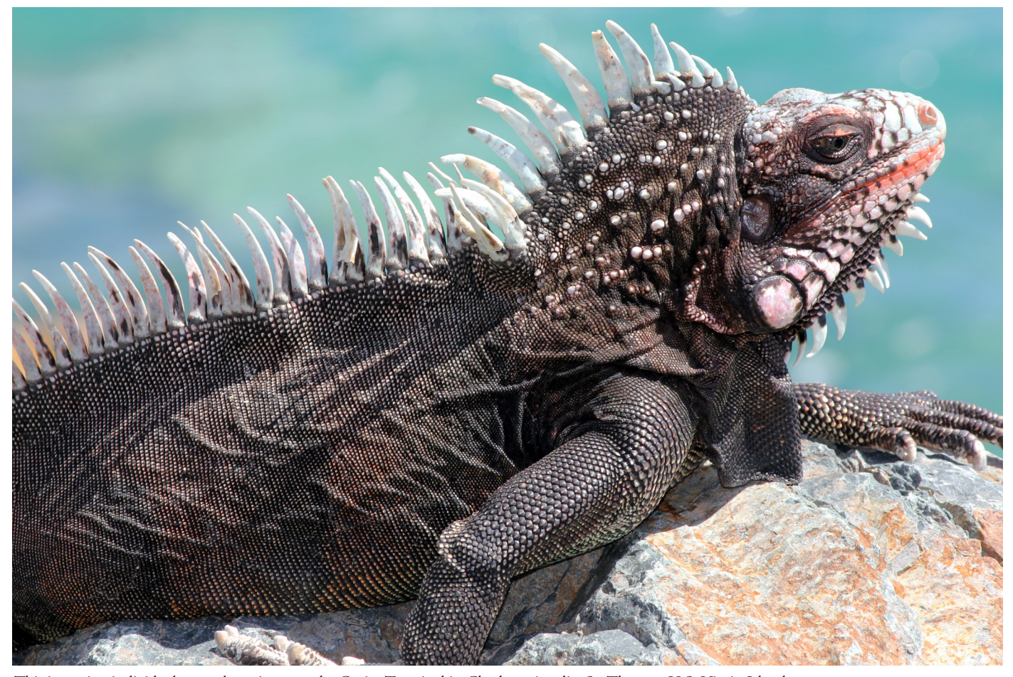
This imposing individual greeted tourists near the Cruise Terminal in Charlotte Amalie, St. Thomas, U.S. Virgin Islands.

implemented a resolution in 2010 that prohibits the importation and commercialization of these reptiles (Pasachnik et al. 2012).