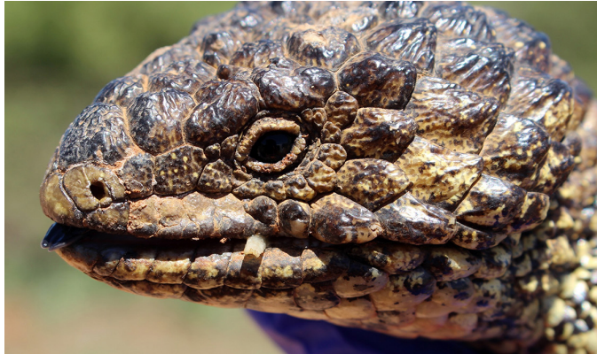
Fig. 3. Part of a Stemless Thistle ( Onopordum acaulon ) leaf is still protruding from the mouth of a Sleepy Lizard ( Tiliqua rugosa ) caught on 23 December 2018.

and leaves of the grass were observed inside its mouth (Fig. 1). At 1115 h on 23 December 2018, the senior author noticed another T. rugosa on the roadside (Fig. 2) of the same dirt road but at a different locality (33°54'47"S, 139°18'35"E; 161 m asl; datum: WGS84). While being handled, this lizard also gaped, and it had fragments of the leaves of Wards Weed ( Carrichtera annua ) and Stemless Thistle ( Onopordum acaulon ) in its mouth (Fig. 3). The senior author also observed