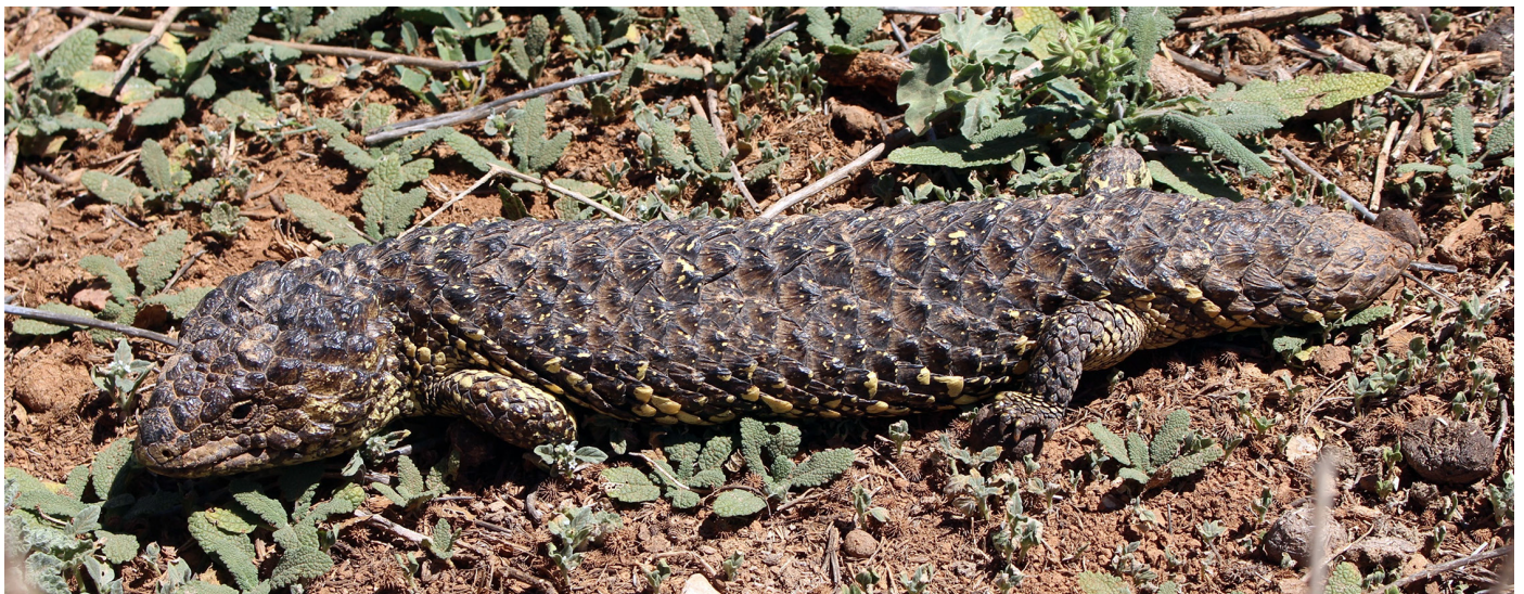
Fig. 2. A Sleepy Lizard ( Tiliqua rugosa ) found on the roadside on 23 December 2018 surrounded by Wild Sage ( Salvia verbenaca ), which is occasionally eaten by these lizards.