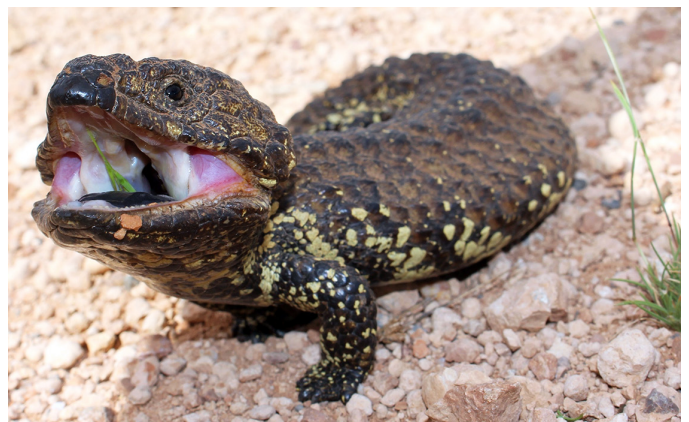
Fig. 1. A Sleepy Lizard ( Tiliqua rugosa ) found on 9 December 2018 eating the inflorescence of a Wild Oat ( Avena fatua ).

At 0945 h on 9 December 2018, the senior author observed a Sleepy Lizard on Salford Road, a dirt road in the Mid North Region of South Australia (33°58'05"S, 139°13'23"E; 213 m asl; datum: WGS84). The lizard was next to a Wild Oat ( Avena fatua ) growing in the road and when the lizard gaped as a threat display, the inflorescence