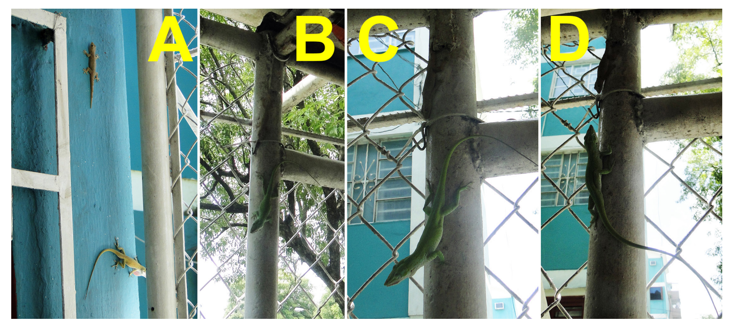
Fig. 3. (A) The Tropical House Gecko ( Hemidactylus mabouia = Hm) moves up and the Cuban Green Anole ( Anolis porcatus = Ap) moves down before jumping back onto the fence. (B) Ap confronts the other Hm on the fence. (C) Ap displays in close proximity to Hm. (D) Ap turns face-to-face with Hm.

The Cuban Green Anole ( Anolis porcatus ) is endemic, abundant, and widely distributed across the Cuban Archipelago where it is frequently associated closely with