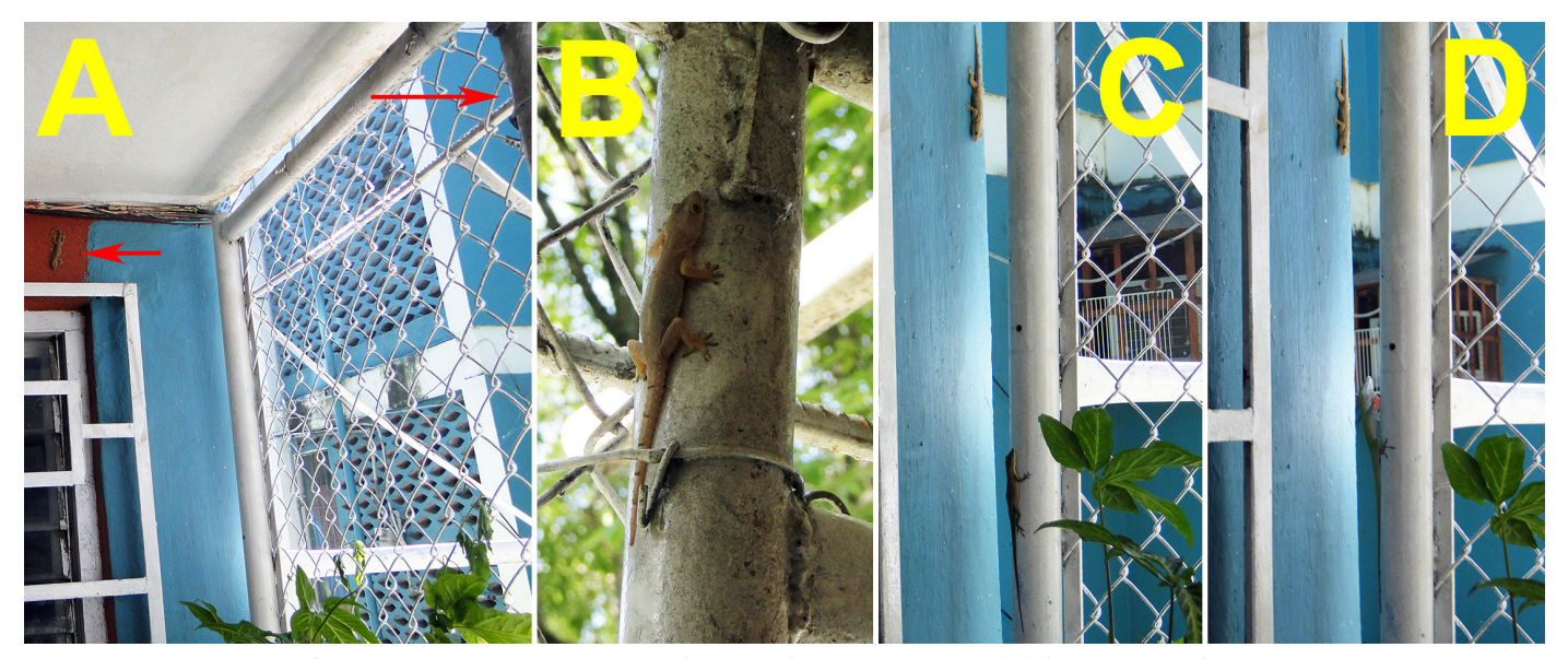
Fig. 1. (A) Initial position of two Tropical House Geckos (Hemidactylus mabouia = Hm) on a wall (left arrow) and a fence post (right arrow). (B) Initial position of Hm on a fence post. (C) A Cuban Green Anole ( Anolis porcatus = Ap) approaches Hm . (D) Ap displays to Hm .

The rate at which non-native reptiles are being introduced around the world has increased in recent times (e.g., Kraus 2009). The resultant competition can affect native species, and evidence of such instances must be studied and understood (Case and Bolger 1991; Rodda and Fritts 1992; Losos et al. 1993; Case et al. 1992, 1994; Petren and Case 1998; Losos and Spiller 1999; Brown et al. 2002; Cole et al. 2005; Dufour et al. 2018). However, the paucity of evidence for competition as a causal or contributing mechanism for extinction could be because interactions between invasive and