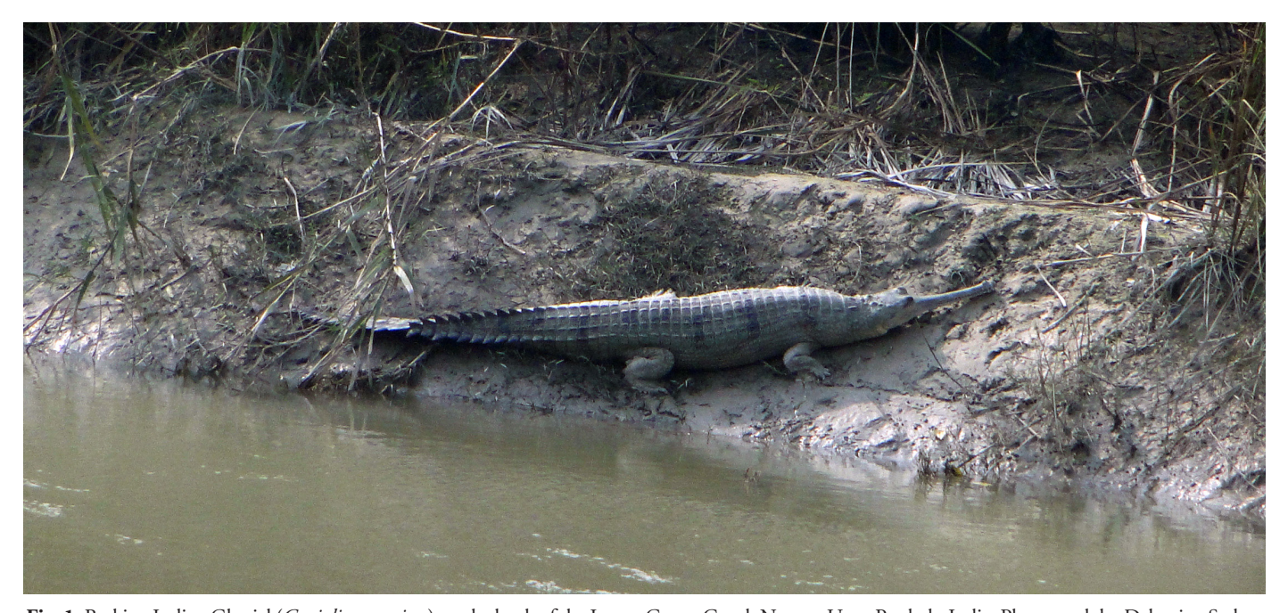
Fig. 1. Basking Indian Gharial (Gavialis gangeticus) on the bank of the Lower Ganga Canal, Narora, Uttar Pradesh, India.

The Gharial is endemic to the Indian Subcontinent, where it occurred historically in the Ganges, Brahmaputra, Indus, and Mahanadi River Systems (Groombridge 1987; Hussain 1999; Singh 1978; Smith 1931; Whitaker 1987);