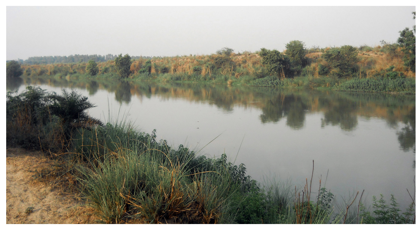
Fig. 3. View of the Lower Ganga Canal.

We are thankful to the Director and Dean of the Wildlife Institute of India for their encouragement to carry out this study. For financial support, we acknowledge the National Mission for Clean Ganga and the Ministry of Water Resources, River Development and Ganga Rejuvenation for the imple-