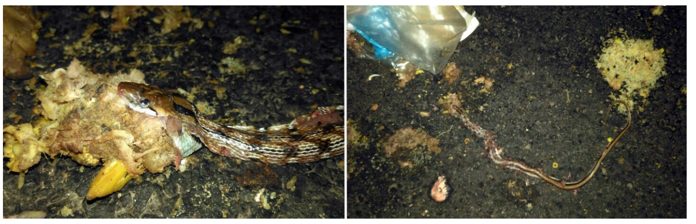
Fig. 2. A road-killed Common Indian Trinket Snake ( Coelognathus helena helena ) with a discarded piece of chicken in its mouth. The plastic bag visible in the second image contained pieces of chicken biryani, plastic plates, boiled rice, and paper.

Ayres (2012), who reported scavenging by snakes in the genus Natrix , suggested that such behavior in snakes might be more common than previously thought, often overlooked, or simply not observed. Lillywhite et al. (2002, 2008) recorded scavenging by Florida Cottonmouths (Agkistrodon conanti) at island bird rookeries and in an intertidal zone, respectively. Shivik and Clark (2012) noted that snakes, such as the Brown Treesnake (Boiga irregularis), that use chemical cues to find food appear to scavenge more frequently than those relying on visual or thermal cues. Sharma et al. (2016) reported the consumption of inanimate objects by an Oriental Ratsnake (Ptyas mucosa) using chemical cues. Mohopatra (2011) and Deshmukh et al. (2016) reported scavenging behavior in Common Indian Kraits (Bungarus caeruleus), and Deshmukh et al. (2017) documented consumption of a plastic bag that had contained food by another Common Indian Krait.