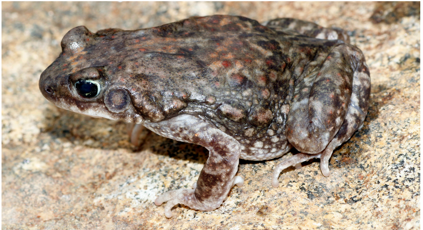
Fig. 1. A Malabar Toad ( Duttaphrynus hololius ) encountered at Chithannavasal, Pudukkottai District, Tamil Nadu.

On 24 October 2013, MR visited the historic Chithannavasal (10°27'59.53"N, 78°44'0.42"E; elev. 127 m), Pudukkottai District, Tamil Nadu. At about 1810 h, he encountered seven toads on rock boulders near the stairs and on the rock wall near naturally flowing water. Considerable rain had fallen two days prior to this sighting. Subsequently, at 1800 h on 14 February 2014, a return to the site revealed no toads. The surrounding grassy area had burned. Again, on 12 September 2017, both authors visited the site and encountered four toads at about 1830 h near puddles and in grassy patches. The toads were examined (not collected) and identified as Duttaphrynus hololius . We also saw Common