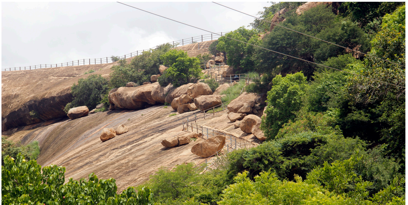
Fig. 3. Habitat at Chithannavasal, Pudukkottai District, Tamil Nadu where Malabar Toads ( Duttaphrynus hololius ) were encountered.