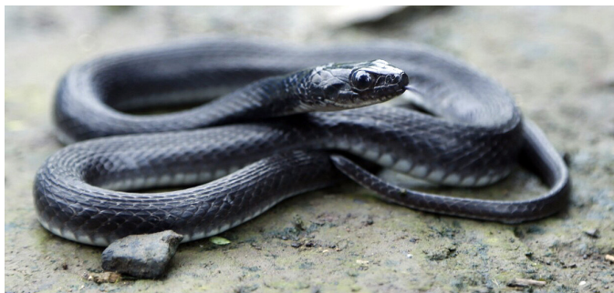
Fig. 7. First record of a Checkered Keelback ( Xenochrophis piscator ) with a completely black dorsum.

tion period of 37–60 days (Daniel 1983; pers. obs.; Fig. 8). A record number of 120 eggs was laid by a Xenochrophis piscator in the Anand District of Gujarat (D.S. Patel, pers. comm.). Eggs average 18 x 27 mm (Daniel 1983), but those laid by captive snakes in my care were slightly larger (29 x 20 mm).