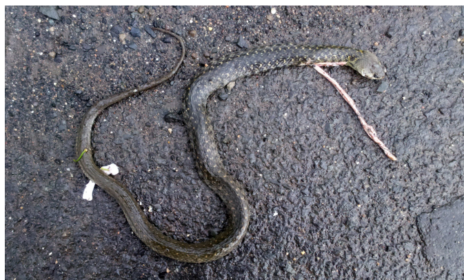
Fig. 3. Checkered Keelbacks ( Xenochrophis piscator ), such as this male, are frequent roadkills during the rainy season.

Reproduction. — Xenochrophis piscator is known to mate in October, and females lay eggs from November to May, usually in a nest hole or in the ground near water (Daniel 1983). In my experience, eggs of this species need high levels of moisture and medium to low temperatures during incubation. Unlike most snakes, X. piscator demonstrates parental care, females staying with their clutches of 8–91 eggs during the incuba-