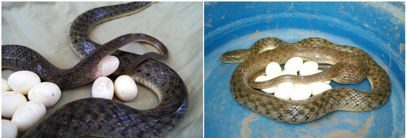
Fig. 8. Checkered Keelbacks ( Xenochrophis piscator ) laying eggs.

ventilated bottle where it appeared to be lifeless. When I gently shook the bottle the snake did not move, so I took it out and placed it on ground. Within a minute, it attempted to escape. I caught the snake and returned it to the bottle, where it again acted as if it was dead. I eventually released that little snake into appropriate habitat.