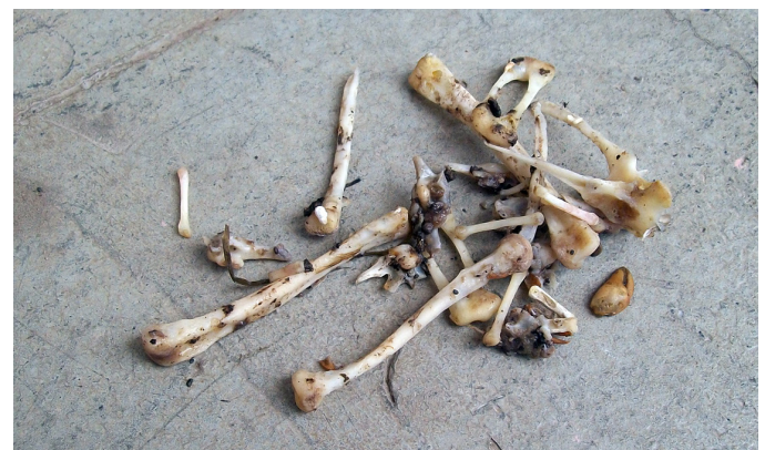
Fig. 4. Frog bones egested by a Checkered Keelback ( Xenochrophis piscator ) from the Hojiwala Estate in the Surat District.