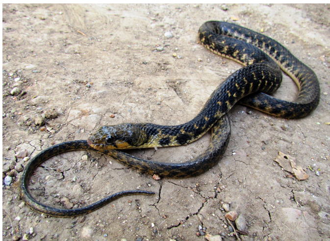
Fig. 6. A black-and-yellow Checkered Keelback ( Xenochrophis piscator ) with extensive black markings from the Saputara Hill Station (elev. 1,000 m) in The Dangs District.