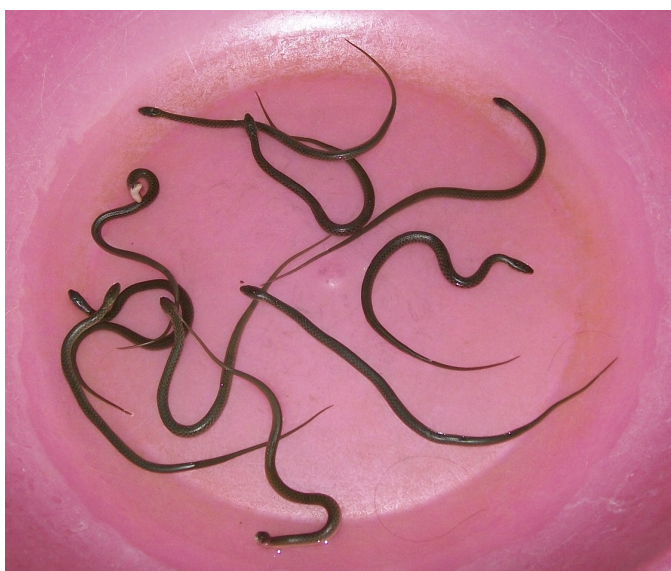
Fig. 9. Hatchling Checkered Keelbacks ( Xenochrophis piscator ) in a container with fresh water in an effort to minimize the effect of phenol to which they were exposed prior to their rescue.