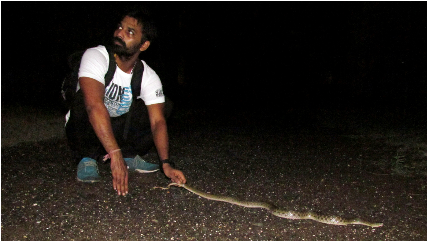
Fig. 10. A Checkered Keelback Snake ( Xenochrophis piscator ) that had vomited blood during its rescue being released near a lake at night after two days of observation.