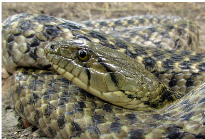
Fig. 5. A Checkered Keelback ( Xenochrophis piscator ) with a dull olive ground color and a moderate amount of black patterning.