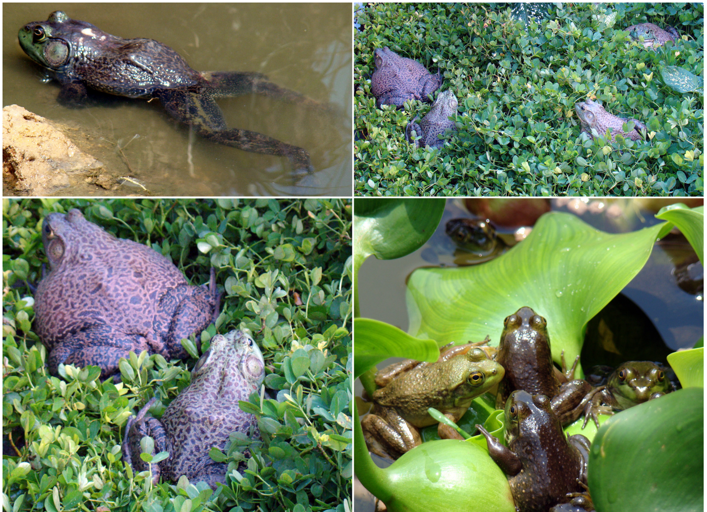
Fig. 1. American Bullfrogs ( Lithobates catesbeianus ) at the Centro de Estudios y Desarrollo para la Amazonía (CEDAMAZ).